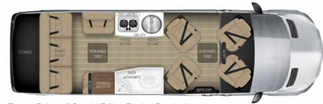
Tommy Bahama® Special Edition Touring Coach - Lounge

The gracious Lounge EXT and Grand Tour EXT floorplans provide ample space for your entire entourage. Generous panoramic windows offer breathtaking vistas. At the end of your relaxing day, the breezy, island-inspired Tommy Bahama® décor and accessories provide welcoming, well-designed touches throughout.