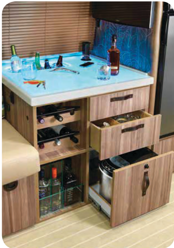
Built-in wine bar offers the ultimate in refined relaxation.

Each trailer comes with a Tommy Bahama® accessory kit, including practical, yet beautifully-designed details for kitchen, bath and bedroom space. All created to make your relaxing getaway even more sublime!