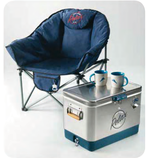
Tommy Bahama® accessory kit completes your beach-inspired experience.