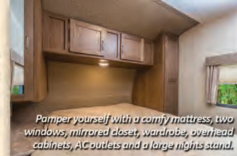
Pamper yourself with a comfy mattress, two windows, mirrored closet, wardrobe, overhead cabinets, AC outlets and a large nightstand.

See our newest pictures, floor plans, styles, and features at www.gulfstreamcoach.com