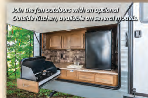
Join the fun outdoors with an optional Outside Kitchen, available on several models.