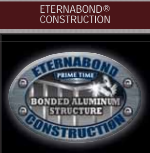
Tracer is built with Prime Time's ETERNABOND® Construction Technology.