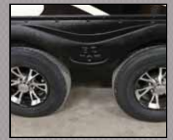
Tracer offers E-Z Tow on most models - another Prime Time innovation designed to minimize "bouncing" while towing.