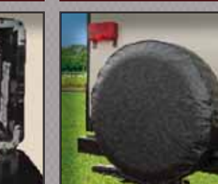
Tracer's spare tire affords peace of mind on board your home away from home!