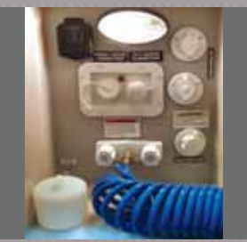
The Universal Docking Station provides easy setup for your camping experience and protects hookups from the elements!