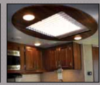
The extra-large skylight adds great natural lighting to the unit's interior.