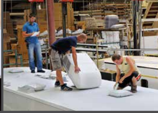
Built strong to enable you to conveniently perform periodic roof maintenance.