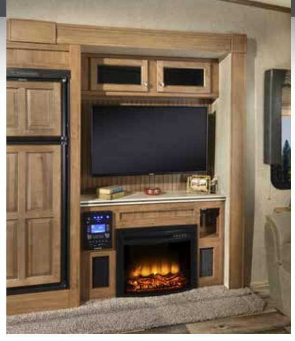
8528CKWSA Entertainment Center