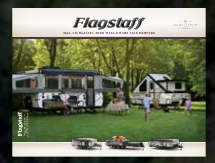
Flagstaff MAC, SE, Classic, High Wall & Hard Side Camping Trailers.