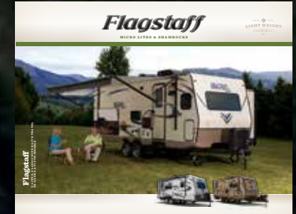
Flagstaff Micro Lite & Shamrocks