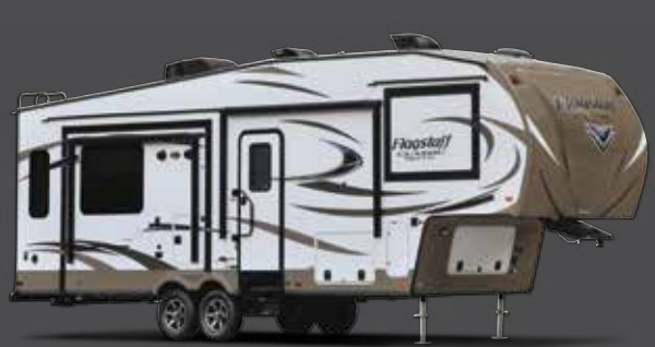
Flagstaff Fifth Wheel models are loaded with features like the Reese Revolution hitch, power stabilizer jacks, slam latches on most storage doors and much more.