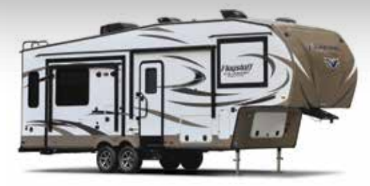
Standard White Exterior