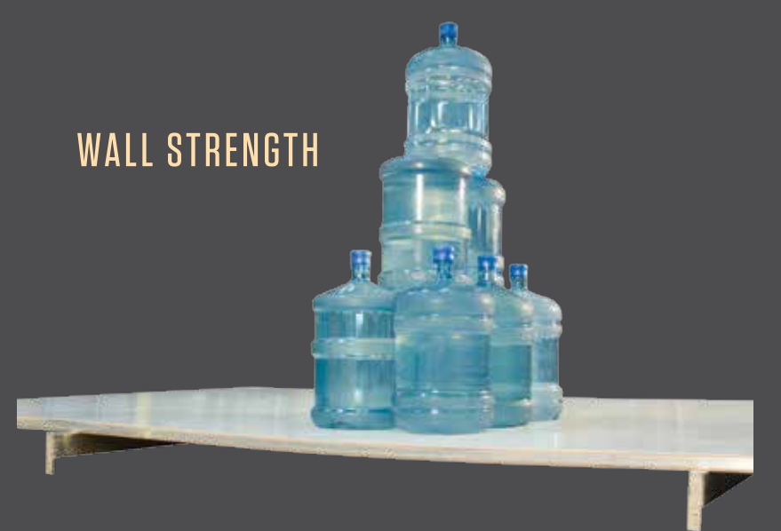
Structurally engineered materials makes our vacuum-bonded walls some of the strongest in the industry.