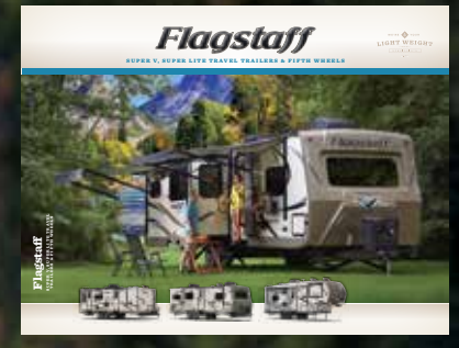
Flagstaff Super V. Super Lite Travel Trailers & Fifth Wheels