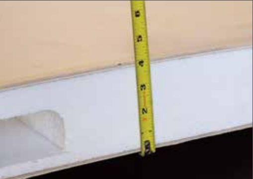
4" thick roof with built in insulated A/C ducts