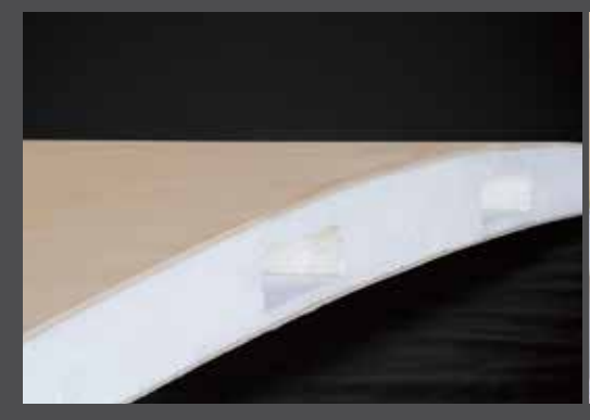
Vacuum-bonded radius roof with vaulted ceiling providing superior insulation and more interior height.