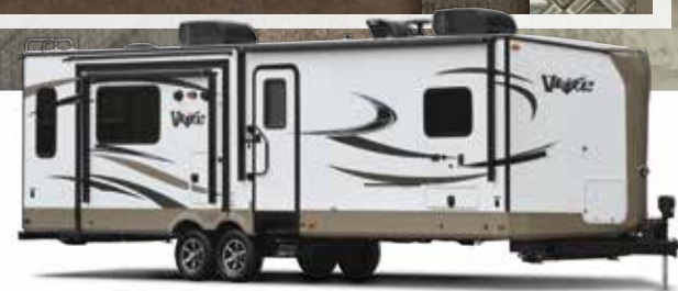
Standard White Exterior