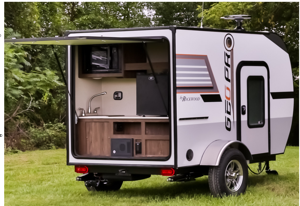
G12RK exterior featuring an outside kitchen.