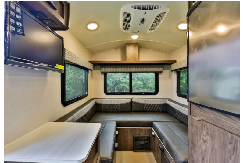
Geo Pro G14FK exterior and interior shots.

The Rockwood Geo Pro line of travel trailers are for those campers that value being environmentally conscious and have chosen to drive today's more fuel efficient "crossover" vehicles and smaller SUV's. With floor plans that weigh within the towing capacity of these type of vehicles, the Geo Pro combines a traditional approach with modern amenities to enhance your camping experience.