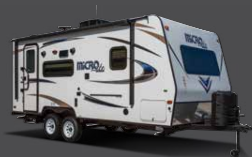
Standard White Exterior