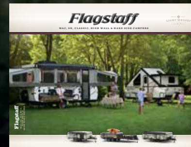
Flagstaff MAC, SE, Classic, High Wall & Hard Side Camping Trailers.