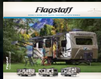
Flagstaff Super V, Super Lite Travel Trailers & Fifth Wheels