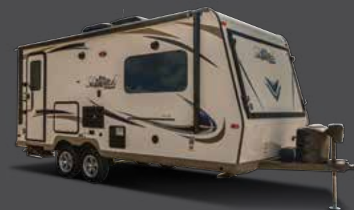
Optional Oyster Exterior

There's more to the Shamrock than blind luck. Whether you are interested in the expanded interior space provided by the spacious drop down bunks with heated innerspring mattresses or the ability to bring an ATV along, the Flagstaff Shamrock will deliver with the quality and amenities you expect. Flagstaff has redefined camping by allowing you to have the necessities of residential living at the campsite.