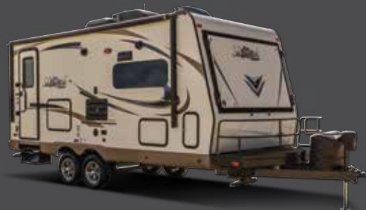
Optional Oyster Exterior

The traditional Flagstaff Shamrock and Micro Lites continue to provide unsurpassed value and comfort. The spacious interiors offer numerous windows, 80" vaulted ceilings with directional vented air conditioning and extensive interior LED lighting throughout. Rich with appointments like solid surface kitchen counter tops and under mount kitchen sinks (select models), a stove top with glass cover, 22" oven and distinctive Maple or Driftwood cabinets with solid wood doors and drawer fronts throughout add to the tremendous value provided.