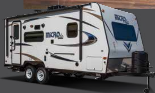
Standard White Exterior

Featuring an aluminum framed with vacuum bonded construction, high gloss fiberglass exterior and deluxe graphics, the Flagstaff Shamrock and Micro Lite products are among the best constructed, most well insulated trailers available on the market today.