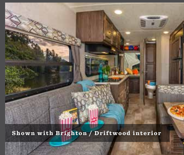
Shown with Brighton / Driftwood interior