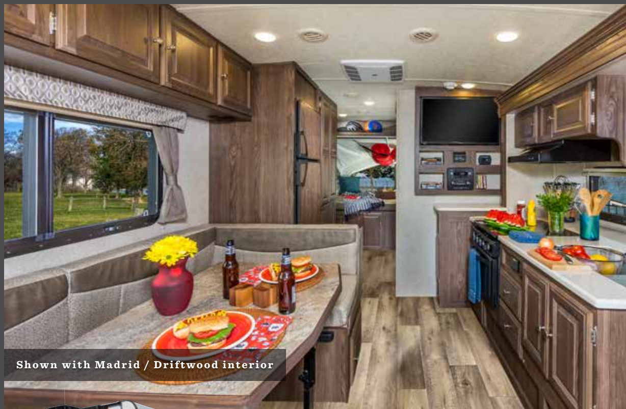
Shown with Madrid / Driftwood interior

Flagstaff travel trailer models are loaded with features like Polished alloy wheels with Nitro filled radial tires mounted to Dexter Torflex Torsion Rubber Ride Axles for a smooth, safe ride, plus that clean Flagstaff look with frameless bonded windows and an automotive front windshield where applicable.