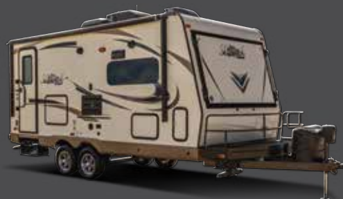
Optional Oyster Exterior