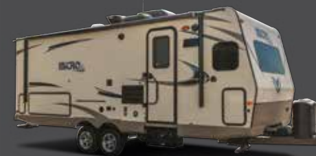
Optional Oyster Exterior

All you need in a perfect, compact package. Micro Lite trailers are excellent for those who want to move from the tent camper to the Light weight towable. The light, small compact design was created for families driving vans and small sport utility vehicles. With residential amenities and excellent features, you're sure to enjoy the Micro Lites.