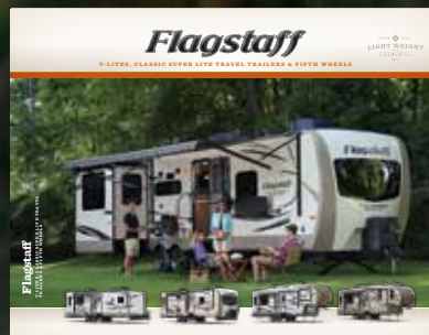
Flagstaff V-Lite, Classic Super Lite Travel Trailers & Fifth Wheels

LOOK FOR OUR OTHER POPULAR LINES OF FLAGSTAFF CAMPING TRAILERS.