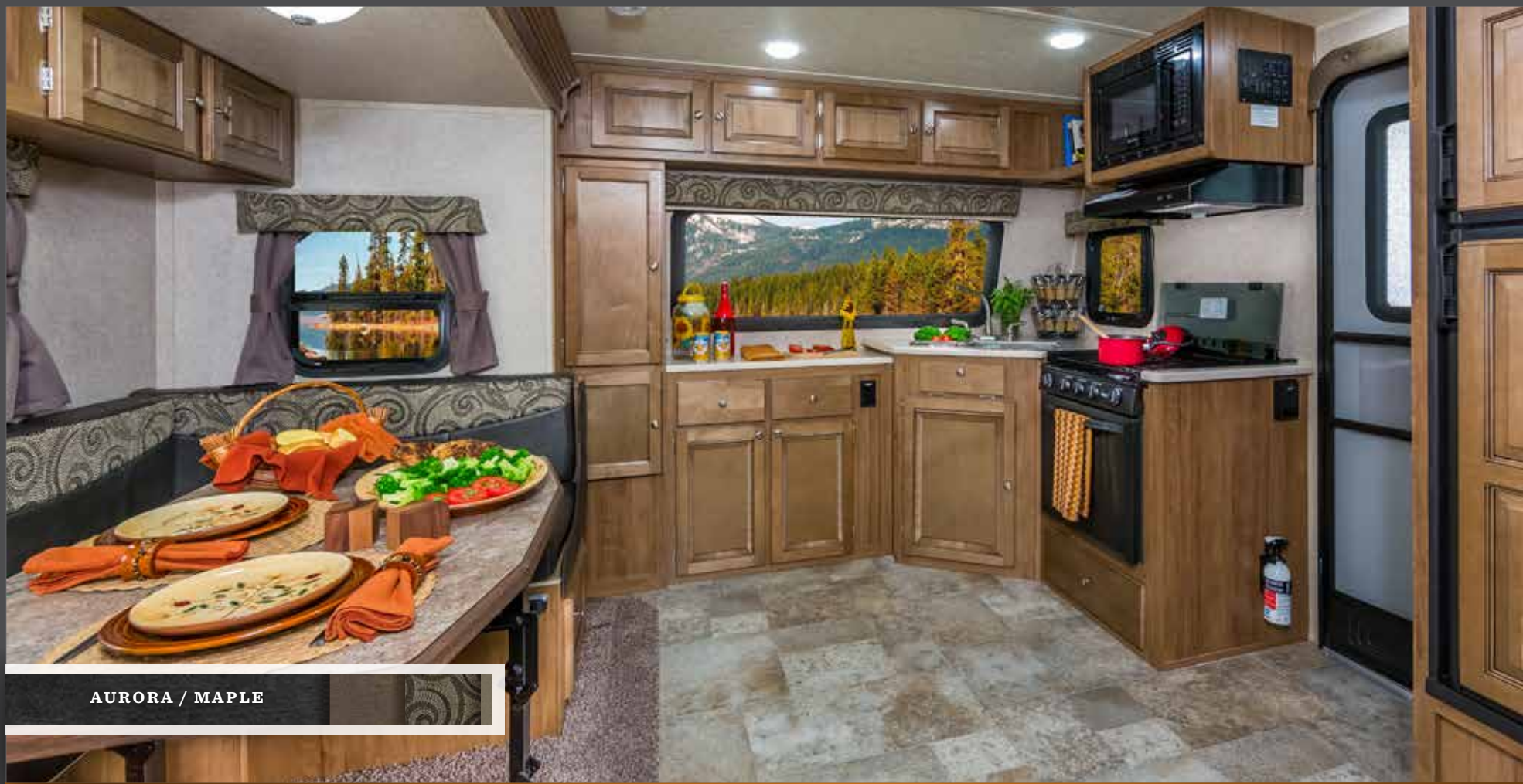
AURORA / MAPLE