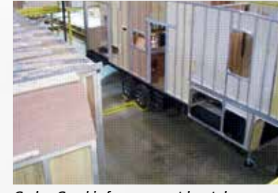
Cedar Creek's famous residential All aluminum Super-structure (Roof, sidewalls, and floor) on 16" centers or less.