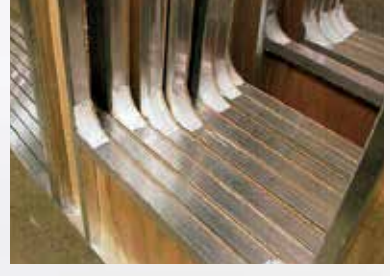
Aluminum window frames