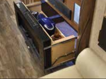
The chef's kitchen - this 38ERK residential rear kitchen features an induction cook top, a stainless steel 30" convection/microwave oven, and LG solid surface countertops. The high sheen Maple cabinetry and new island Medallion ceiling fixture with Infinity lighting adds a touch of elegance.

Storage, storage! The 38ERK features a full three drawer pull-out pantry above the wine cooler, a three-tier lazy susan with three spice racks, a peg board adjustable plate drawer, and secret storage behind the 48" fireplace. Cedar Creek Champagne is the smart choice for the experienced RV'er.