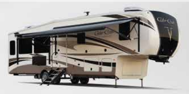
True Nobel Classic fiberglass gelcoat exteriors and end walls. Truly the best of the best in fiberglass. Accept no imitations.