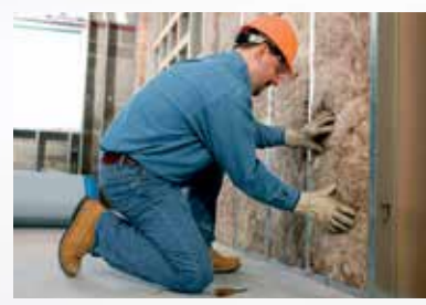
Residential Glasswool Insulation. designed by nature.