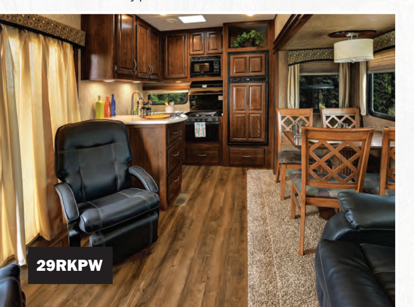
BELOW RIGHT : Island living at its best. Residential furniture with an 80" residential hide-a-bed, reclining theatre seating, solid surface countertops, high-rise pullout kitchen faucet and much, much more – all standard on the Black Diamond by Forest River!

BELOW LEFT: Our Executive Chef Kitchen with class-leading storage brings all the comforts of home to your campsite! More doors and drawers across the board, huge wrap-around Solid Surface counter space, and custom cabinetry provide convenience and comfort on the road.