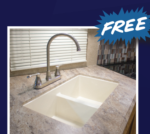
UNDER MOUNT DUAL BASIN DEEP KITCHEN SINK