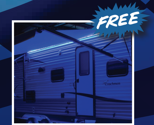
REMOTE OPERATED POWER AWNING WITH LED LIGHT