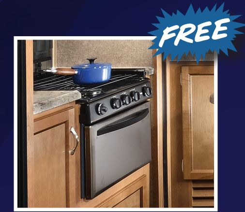
STAINLESS STEEL OVEN