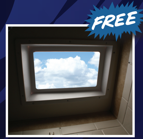
SKYLIGHT ABOVE TUB/ SHOWER