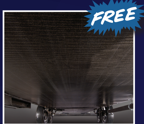
STANDARD ENCLOSED UNDERBELLY PROTECTS YOUR COACH AND IMPROVED AIRFLOW ALLOWS FOR A STURDIER RIDE

USE THE QR CODE SCANNER ON YOUR SMARTPHONE TO SCAN THE QR GODE BELOW AND SEE OUR EXCLUSIVE STARLIGHT SYSTEM IN ACTION.