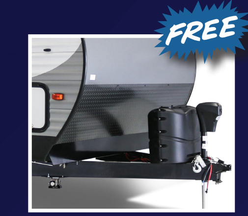
FRONT DIAMOND PLATE