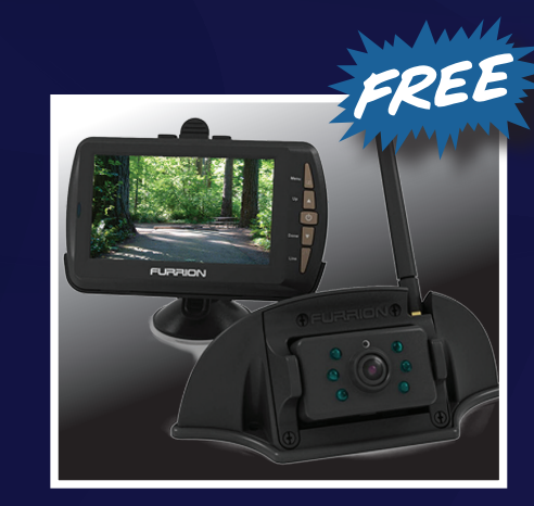
REAR VISION CAMERA PREP