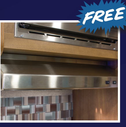
STAINLESS STEEL RANGE HOOD