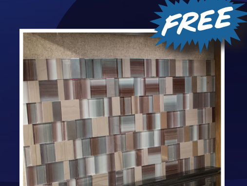
MOSAIC TILE BACKSPLASH