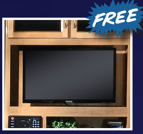
32" FLAT SCREEN LED TV AND SWING ARM BRACKET