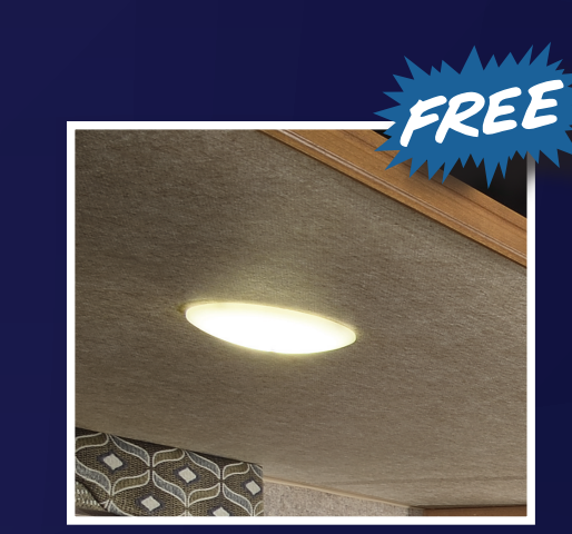
LED INTERIOR LIGHTING