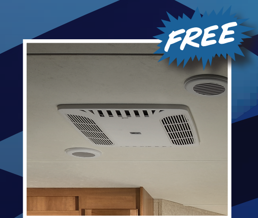
13,500 BTU DUCTED A/C