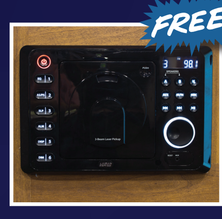
AM/FM RADIO WITH CD AND DVD PLAYER