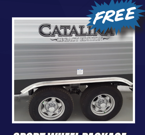
SPORT WHEEL PACKAGE (SILVER E-COAT SPORT WHEELS WITH CHROME HUBS AND LUGS )