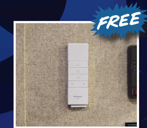
REMOTE OPERATED STARLIGHT SYSTEM