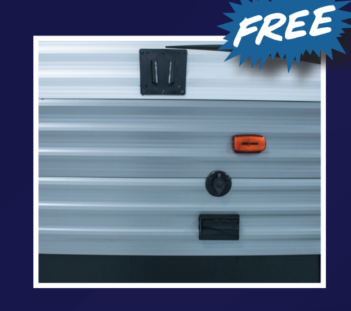
EXTERIOR TV MOUNT, CABLE HOOK-UP AND 110V RECEPT