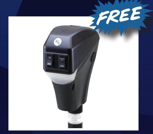
POWER TONGUE JACK