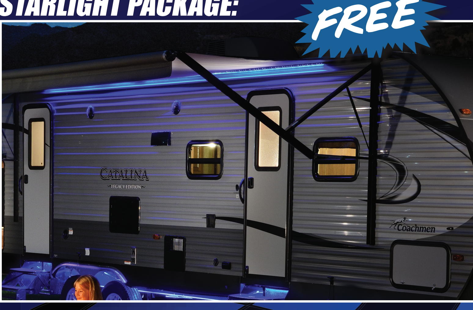
THE CATALINA TRAILBLAZER INCLUDES THE STARLIGHT PACKAGE FEATURING A REMOTE CONTROLLED POWER AWNING AND LED SYSTEM. THE LED SYSTEM INCLUDES AWNING LIGHTS AS WELL AS UNDERBODY LIGHTS TO LIGHT UP THE NIGHT