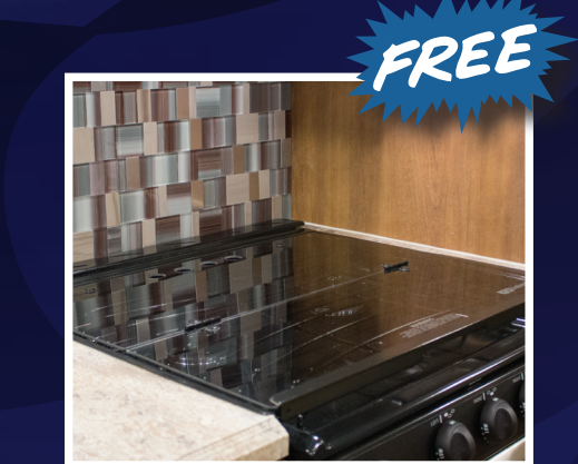
FLUSH MOUNT STAINLESS STEEL 3 BURNER RANGE WITH BI-FOLD GLASS RANGE TOP