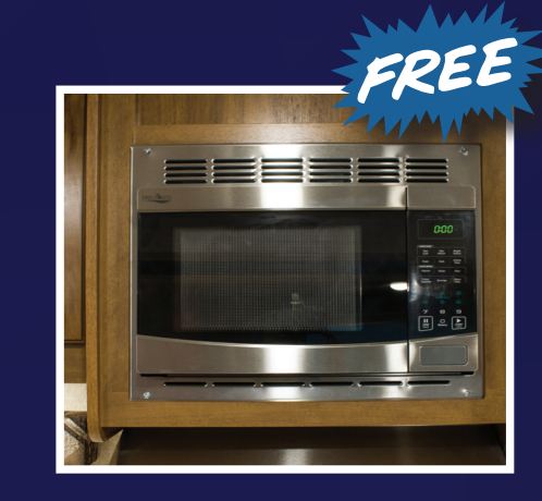
STAINLESS STEEL MICROWAVE