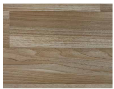
RESIDENTIAL VINYL FLOORING