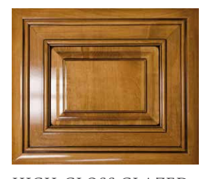
HIGH-GLOSS GLAZED RESORT CHERRY (CLASS A)