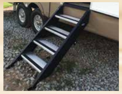
This newly designed 5 tier, folding entry step gives you an easier entry into our extra wide 32" entry door.