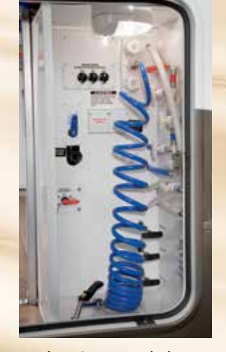
Docking Station includes outside shower, black tank flush, water bypass, 12V battery disconnect, selector switches, dump valves, water tank and city fills for centralized convenience.