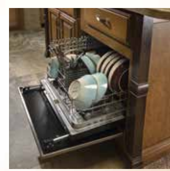
A stainless steel dishwasher is optional on select models. (36CKTS, 36CK2, 38CK2, 38FBD)