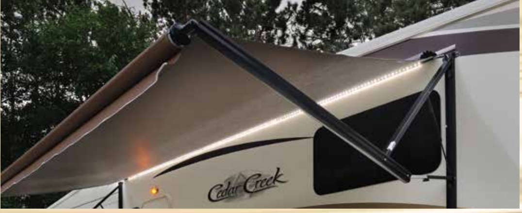
A&E metal wrapped awning with LED night light strip.