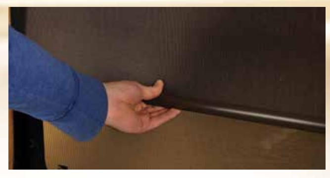
These day shades with blackout roller shades offer the best of both worlds. They're actually two shades in one - a night fabric lowers completely for privacy, or can be retracted to the top to reveal a full length day shade. Both day and night shades can be set in any position and are designed with speed and length controls for privacy or a scenic view.