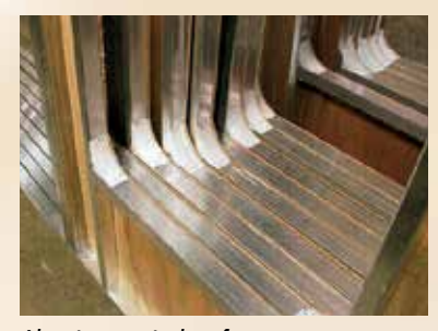
Aluminum window frames.