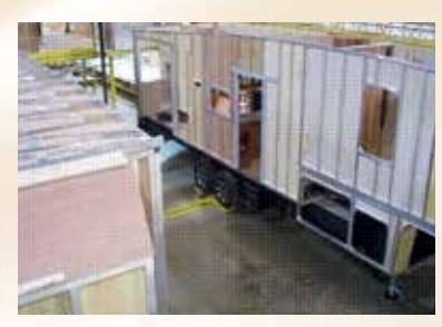
Cedar Creek's famous residential All-aluminum Super-structure (Roof, sidewalls, and floor) on 16" centers or less.