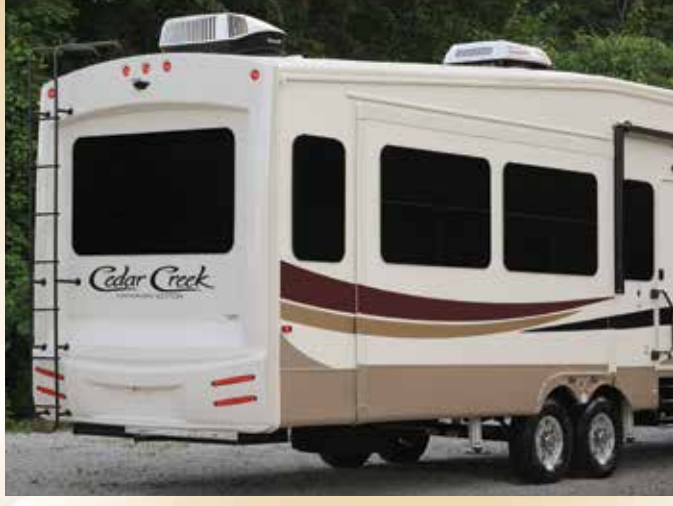
True Nobel Classic fiberglass gelcoat exteriors and end walls. Truly the best of the best in fiberglass. Accept no imitations.

Remote control for slides, hydraulic jacks, awning and security lights Black metal wrapped A&E awnings with LED night light strip Radiant Shield thermo-foil R-38 value Heating pads on all tanks