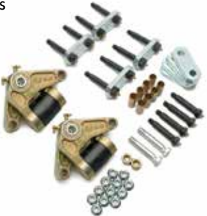
Dexter E-Z Flex® Suspension Standard