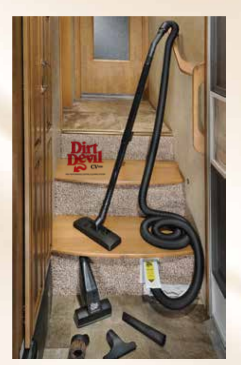
Dirt Devil® CV950 central vacuum cleaning system with VacPan™ automatic dustpan at entry door.