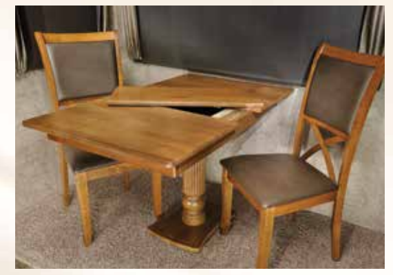
Our freestanding table comes standard with a large leaf extension and four chairs, (two with hidden storage and two fold-away).