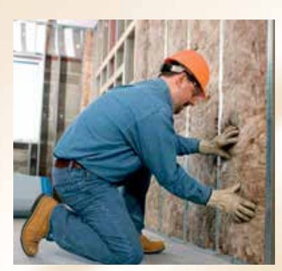
Residential Glasswool Insulation, designed by nature.