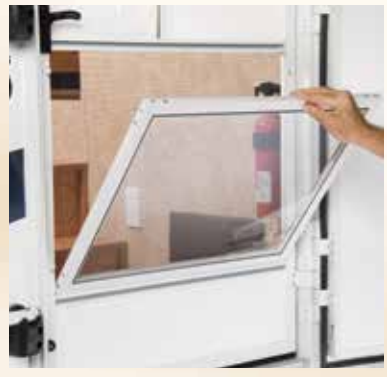
Removable "Soft Top" Vinyl Storm Doors allow light and visibility without losing cooling or heating.