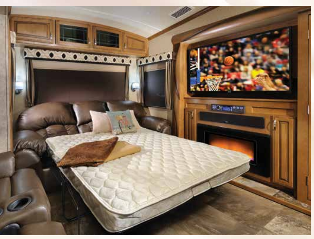
Our La-Z-Boy® Hide-a-Bed sofas include a La-Z-Boy® quilted mattress.