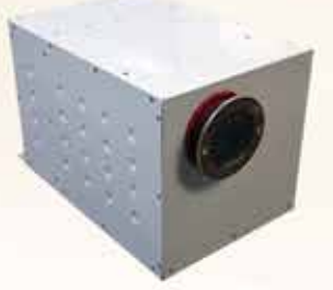
All Cedar Creeks are now equipped with a two-stage, on demand, water heater with 5 burners. It uses 50% less propane than a standard RV water heater and has freeze protection.