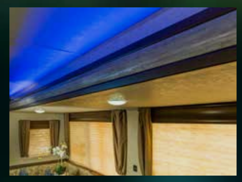
LED Strip Lighting (Not available on all models)