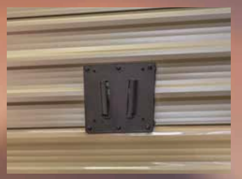
Outside TV Bracket and Hook Ups