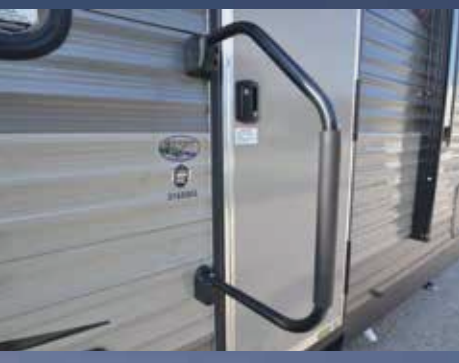
Large Exterior Folding Assist Grab Handle