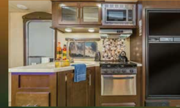
Super Kitchen (extra lighting, glass doors, ceiling mount)