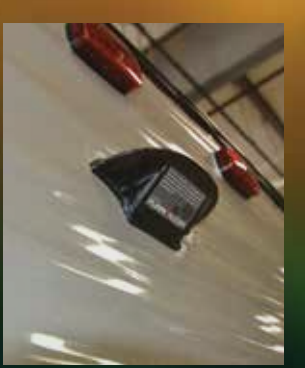
Back Up Camera Ready

*Not all items available on all models. See participating dealers for details.