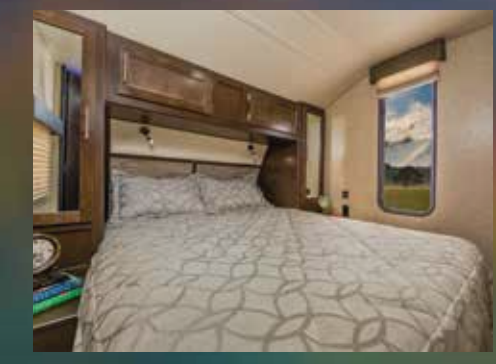
Premium Bedding Ensemble and Comforter

Sofa with arm rest and cup holders also featuring sofa bolster