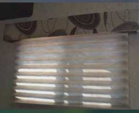
Night Shades *