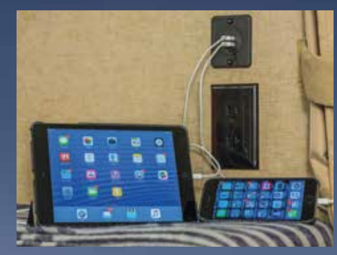
USB charging stations (Beds, Bunks, Table where Applicable)