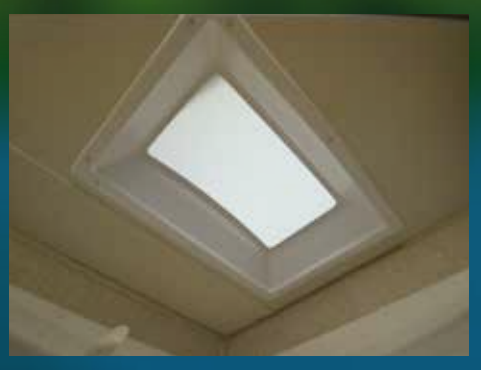
Sky Light Over Tub