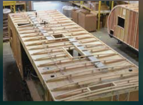
Ducted A/C *