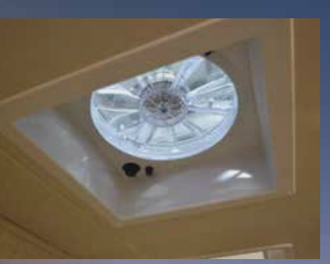
Bathroom Fantastic Vent Fan