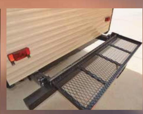
Flip Down Travel Rack (Not available on all models)

Stainless Kitchen Suite Appliance Package