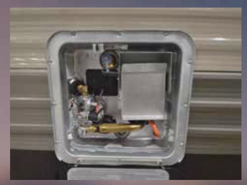
6 Gallon Gas/Electric DSI Water Heater

*Optional package. Not all items available on all models. See participating dealers for details.