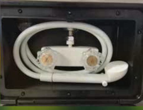
Outside Shower With Hot And Cold Water