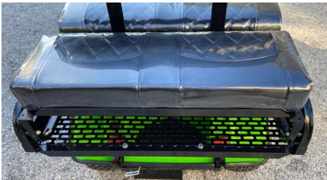
SX3 Rear Passenger Seat

To convert your rear seat into the rear cargo carrier for a non-passenger load-carrying capacity, simply grab the rear frame of the rear passenger seat and flip it toward the rear and down.