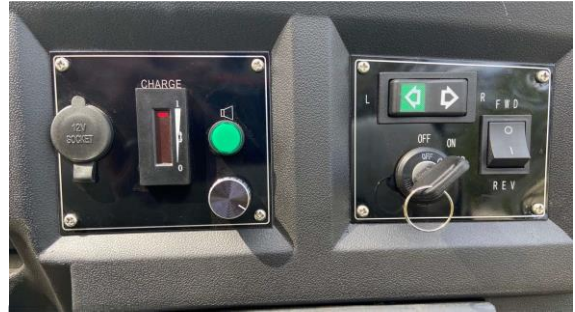
SX3 Dash Panel

OFF: With the key in the OFF position, all electrical circuits are switched off. The key may now be removed.