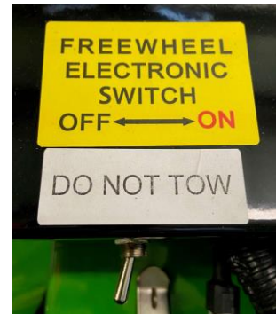
Freewheel Electronic Switch

The turn signals are activated with the switch on the dash.