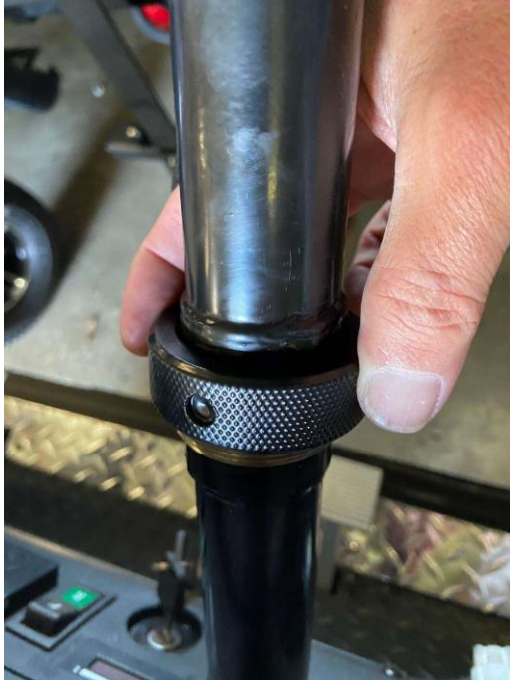
Figure 2.1.2 SX3 Steering Shaft Nut

2.1. Make sure the steering wheel is in the correct orientation for driving straight and the front wheels are pointing straight. Line up the square pin (Fig. 2.1.1) on the lower shaft with the upper shaft and slide the two shafts together. Then tighten the large nut on the upper shaft until tight. (Fig. 2.1.2)