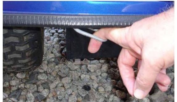
SX3 Free-Wheel Lever