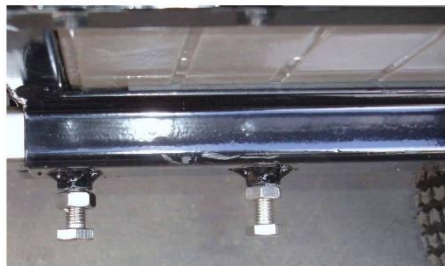
SX3 Chassis Rigidity Adjustment

NOTE: Whenever there is any doubt whatsoever about anything involved with the operation, maintenance, and safe operation of your CRICKET SX3, always call FREE TECHNICAL SUPPORT at 321-752-4041, or e-mail us at sales@melbourncricket.com