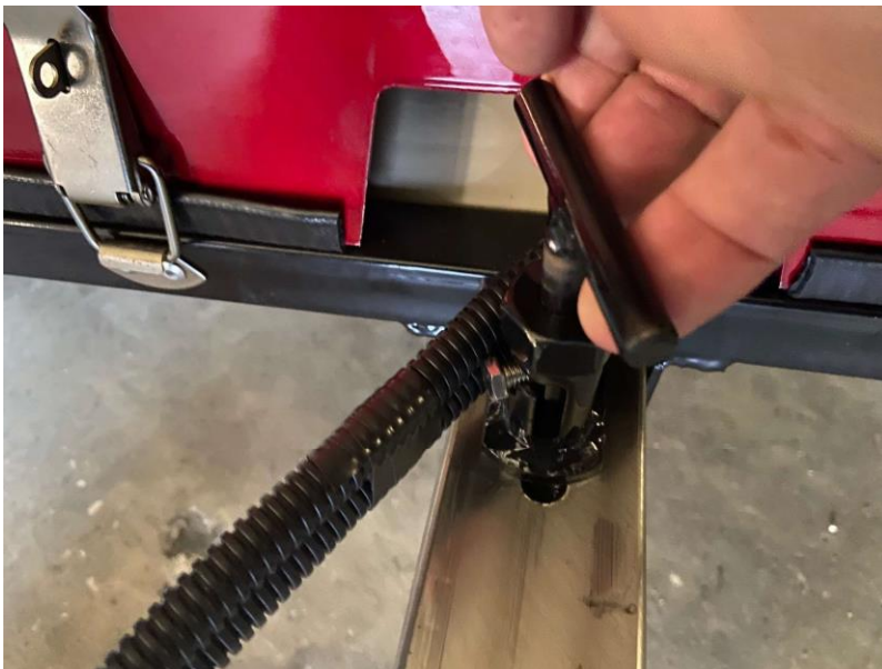
Figure 3.1.1 SX3 T-Lever Released

3.1. Use your hand to pull up on the spring-loaded T-Lever in the center of the permanent floorboard. Turn the lever clockwise until it locks open. (Fig. 3.1.1)