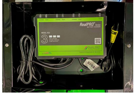
SX3 Battery Charger