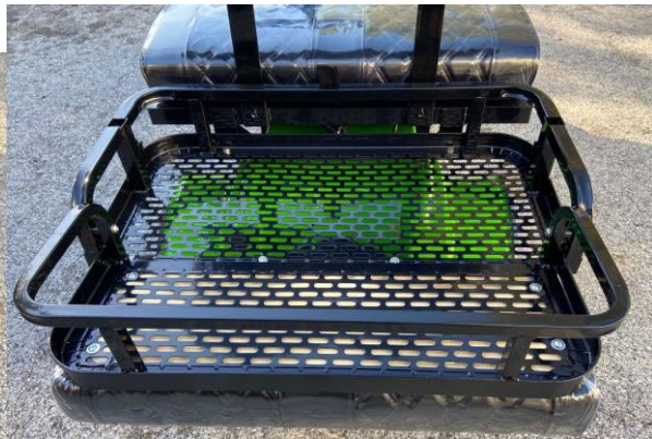
SX3 Rear Cargo Carrier