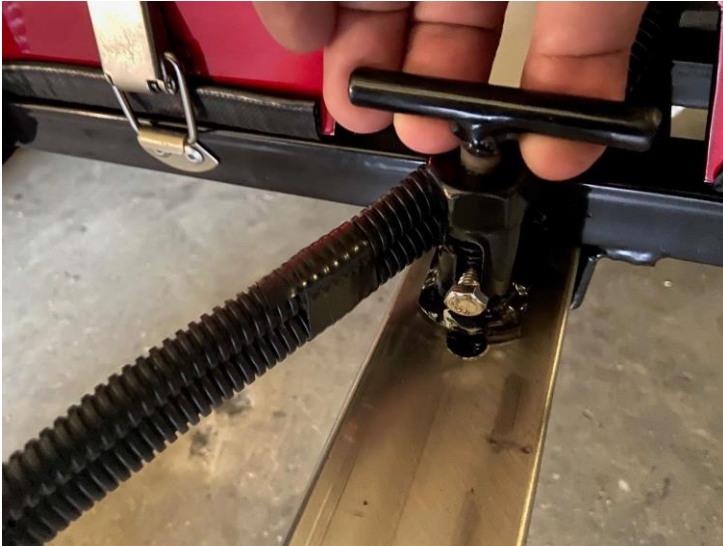
Figure 3.2.2 SX3 T-Lever Locked