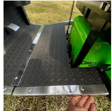
Figure 3.5.1 SX3 Floorboard Installation