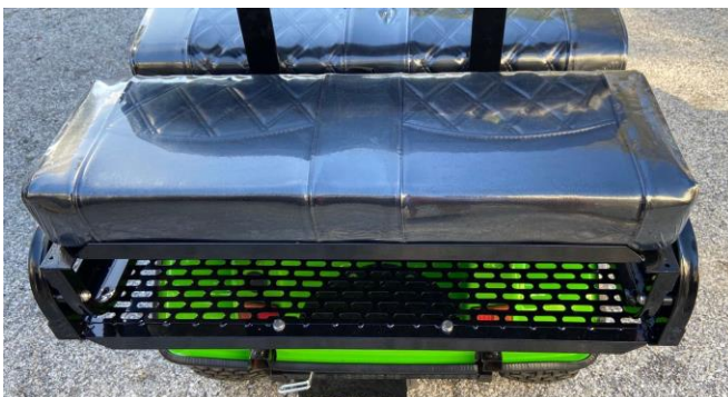
ESV Rear Passenger Seat

To convert your rear seat into the rear cargo carrier for a non-passenger load-carrying capacity, simply grab the rear frame of the rear passenger seat and flip it toward the rear and down.