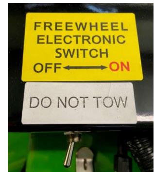
Freewheel Electronic Switch