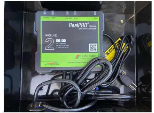
ESV Battery Charger