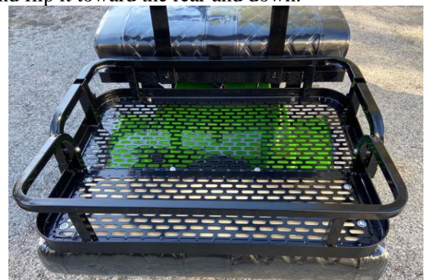
ESV Rear Cargo Carrier