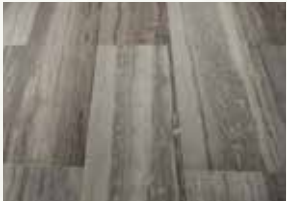
TILE LOOK LINOLEUM OPTION