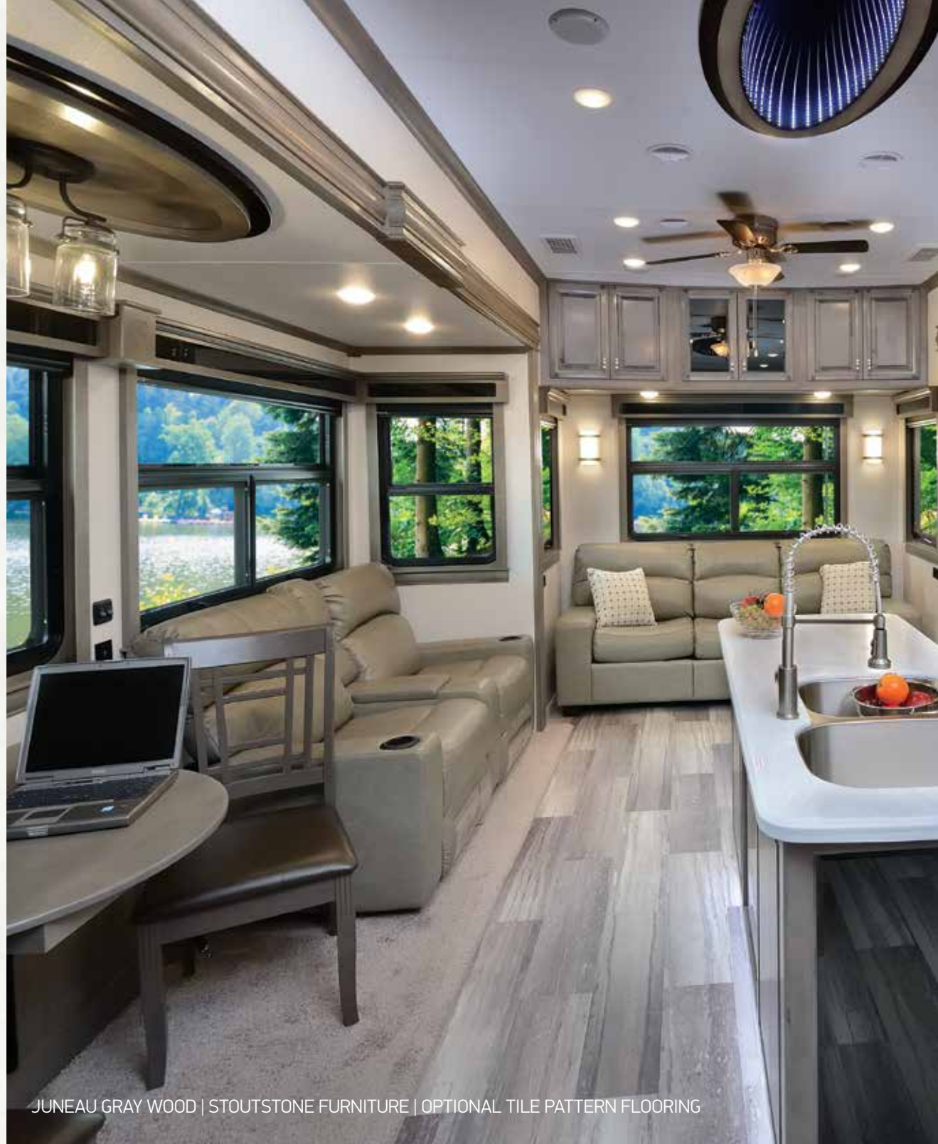
JUNEAU GRAY WOOD | STOUTSTONE FURNITURE | OPTIONAL TILE PATTERN FLOORING

Although this unit was awarded 2019 RV News Best in Show for Luxury Fifth Wheels, the 39RLW is more than just a pretty face. Enjoy the view from the master suite through the front cap panoramic window. The new bedroom design features an added lounge area providing an additional spot to relax while enjoying the extended stay lifestyle.