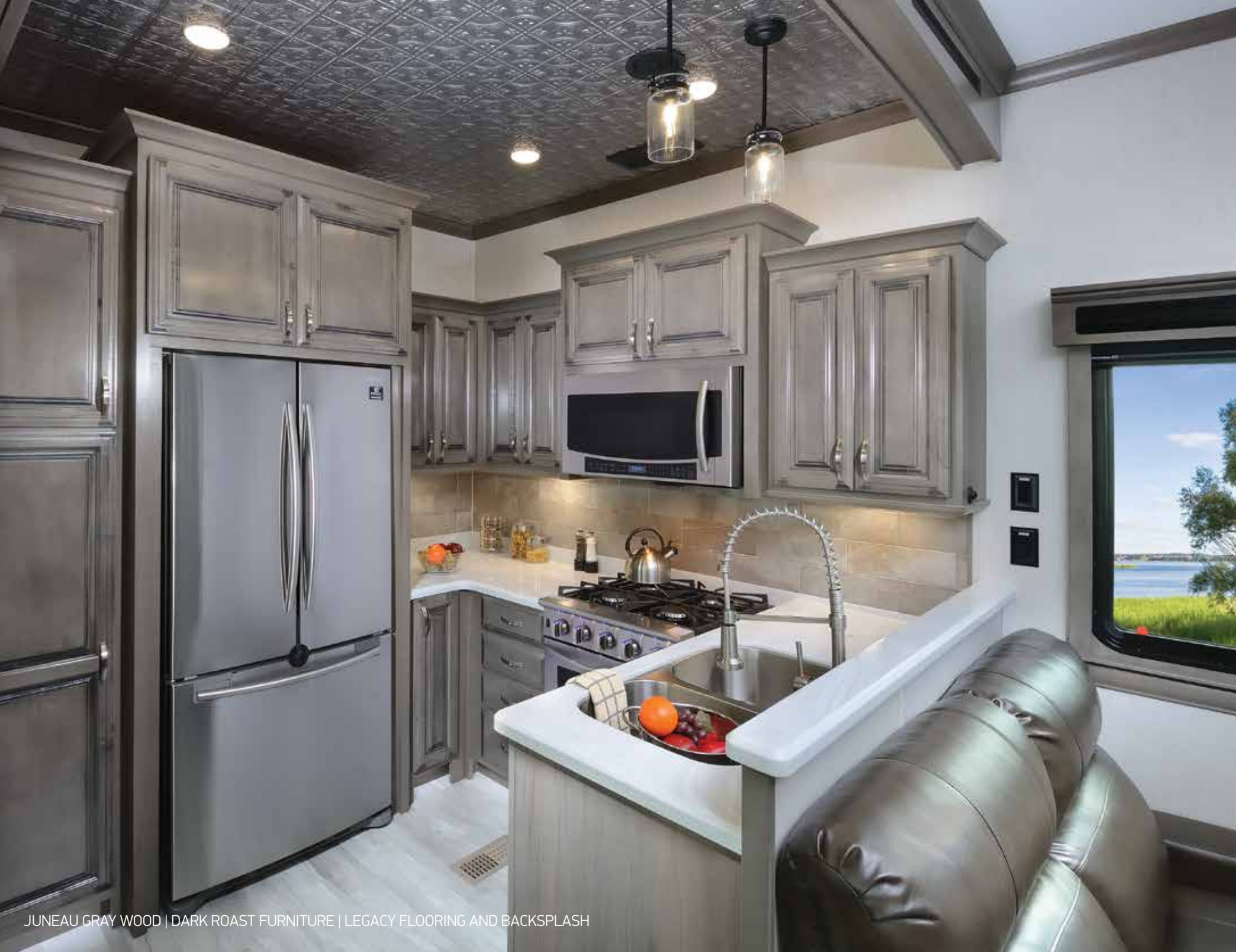
JUNEAU GRAY WOOD | DARK ROAST FURNITURE | LEGACY FLOORING AND BACKSPASH