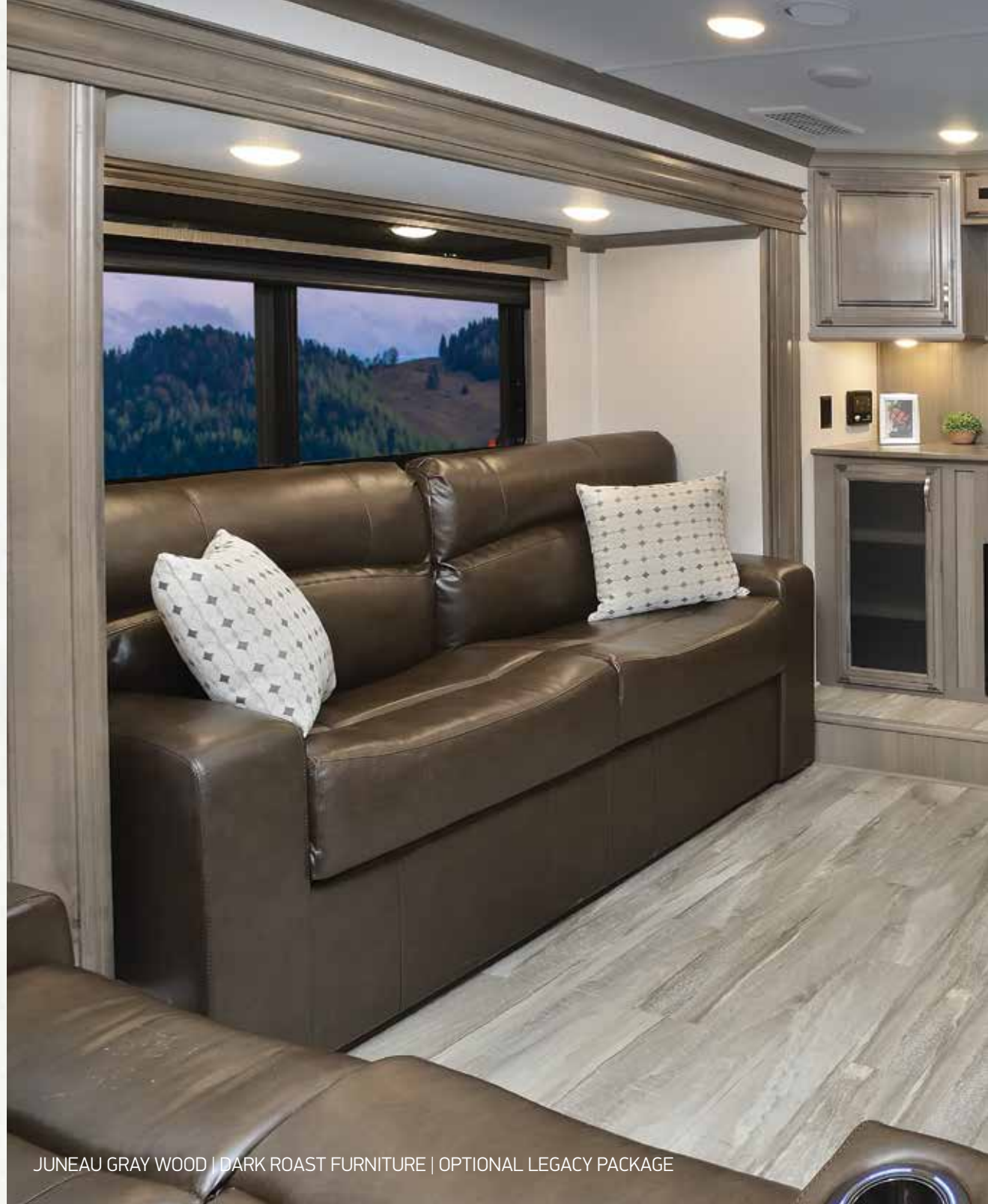
JUNEAU GRAY WOOD | DARK ROAST FURNITURE | OPTIONAL LEGACY PACKAGE

The 39RBFL is equipped with a master suite full bath featuring dual sinks and large shower. A second half bath comes standard with a washer and dryer. In the spacious living room, you'll find the added convenience of a standard desk giving you the benefit of an office without sacrificing space (optional hide-a-bed sofa in place of desk). Cozy up in front of the electric fireplace in your generously appointed living area.