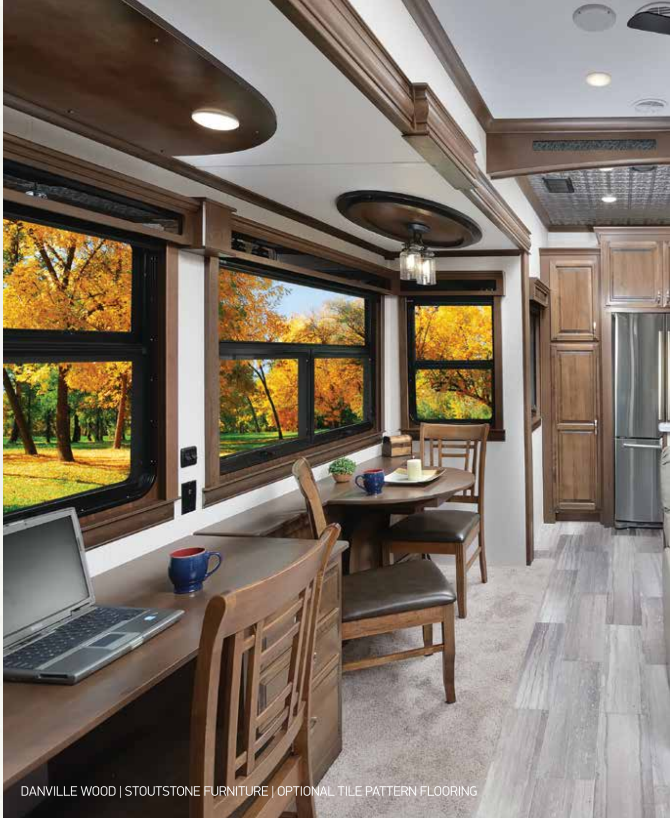
DANVILLE WOOD | STOUTSTONE FURNITURE | OPTIONAL TILE PATTERN FLOORING

The 39RKFB is designed with your dream kitchen in mind. A cupboard for every pan, a shelf for every dish, and enough counter space to prepare a meal for the entire campground. This great kitchen features a residential stainless steel dual bowl sink, Fischer Paykel dishwasher, 18 cu. ft. French door refrigerator, and 30" stainless steel microwave, overall every part of this luxury unit is grandly appointed.