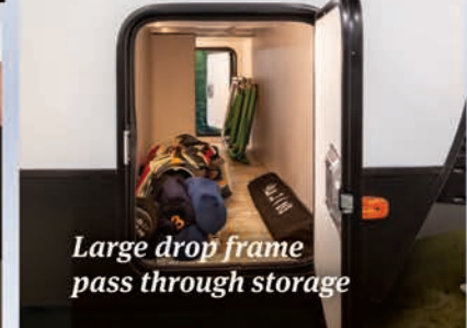
Large drop frame pass through storage