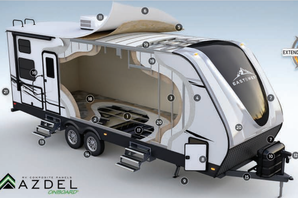
EXTENDED CLIMATE GUARD