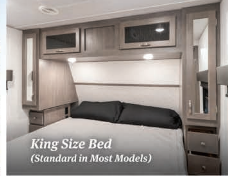
King Size Bed (Standard in Most Models)