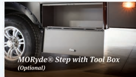
MORyde® Step with Tool Box (Optional)