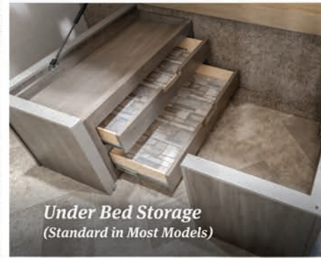
Under Bed Storage (Standard in Most Models)