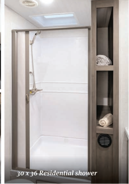
30 x 36 Residential shower