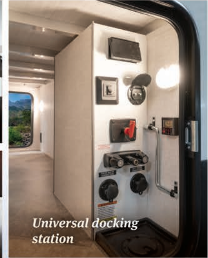
Universal docking station