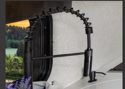
Residential Pullout Faucet