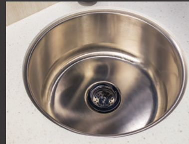
Deep Stainless Steel Sink