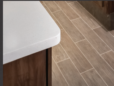
LG Solid Surface Countertop