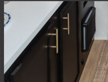
Solid Wood Cabinet Doors