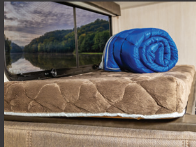
Oversized Bunk Pads