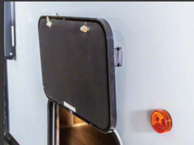
Hands Free Baggage Door Catch