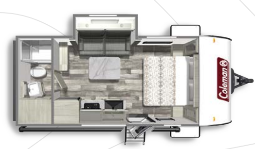
LIGHT 1805RB Length: 22' 9" Weight: 4,503 lbs. Sleeps: 2-4 Hitch: 536 lbs. Height: 10' 10"