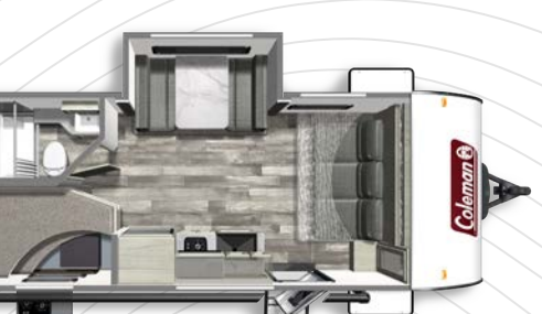
LIGHT 1905BH Length: 23' 11" Weight: 4,537 lbs. Sleeps: 2-3 Hitch: 609 lbs. Height: 11' 1"