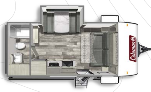
LIGHT 1855RB Length: 22' 11" Weight: 4,308 lbs. Sleeps: 2-3 Hitch: 584 lbs. Height: 10' 7"