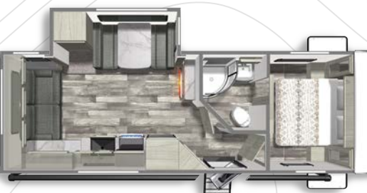
LIGHT 2515RL Length: 29' 5" Weight: 5,685 lbs. Sleeps: 2-4 Hitch: 611 lbs. Height: 10' 11"