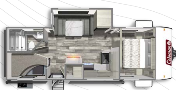
LIGHT 2455BH Length: 28' 11" Weight: 5,5708 lbs. Sleeps: 6-8. Hitch: 662 lbs. Height: 10' 11"