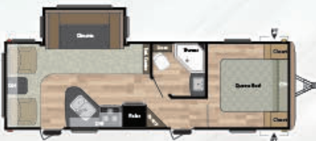
WEIGHT 6007 LENGTH 29' 7" 258RLWE