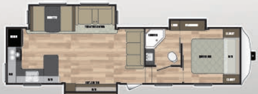
WEIGHT 8880 LENGTH 33' 9" 302FWRK