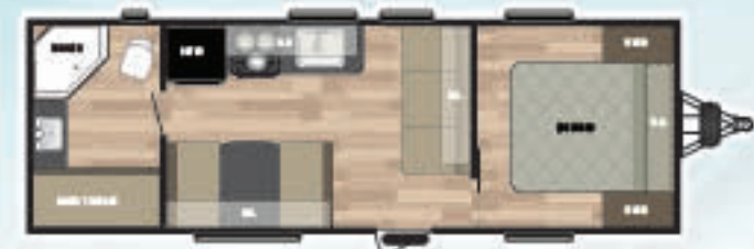
WEIGHT 4751 LENGTH 27' 11" 245RBWE