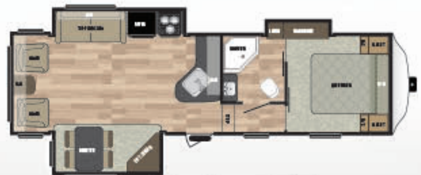
WEIGHT 8157 LENGTH 31' 278FWRL