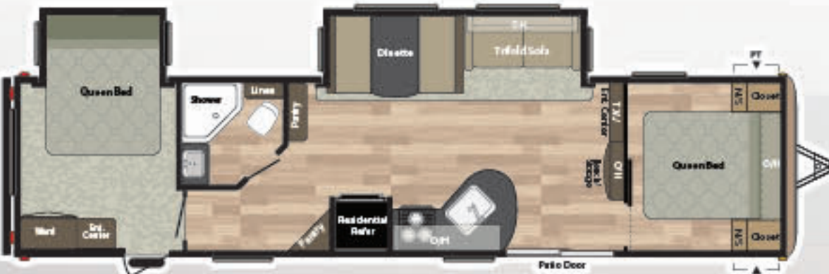
WEIGHT LENGTH 38FL 8587 38' 11"