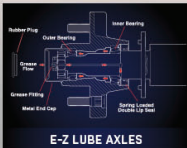
E-Z LUBE AXLES