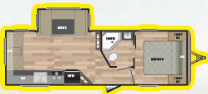
WEIGHT 6030 LENGTH 29' 11" 252RLWE NEW