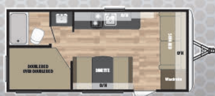
WEIGHT LENGTH 1850FL 3350 21'5"