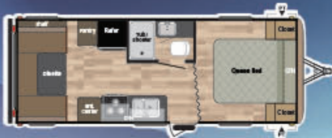
WEIGHT 4290 LENGTH 24' 10" 202QBWE