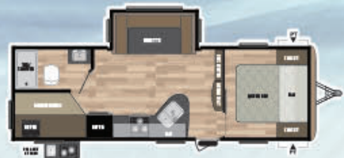
WEIGHT 5765 LENGTH 28' 11" 240BHWE