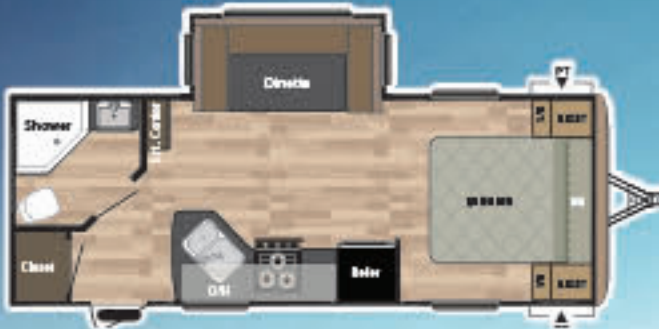
WEIGHT 5345 LENGTH 25' 11" 212RBWE