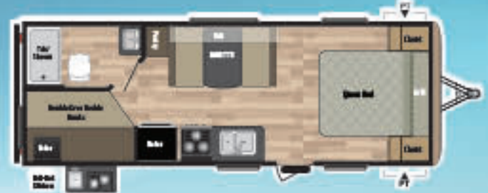
WEIGHT 4701 LENGTH 26' 10" 220BHWE