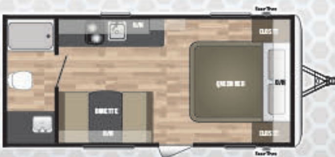
WEIGHT LENGTH 1700FQ 3235 21'5"