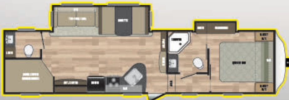
WEIGHT 8595 LENGTH 34' 10" 300FWBH NEW