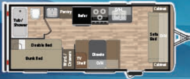
WEIGHT 4242 LENGTH 23' 7" 189FLWE