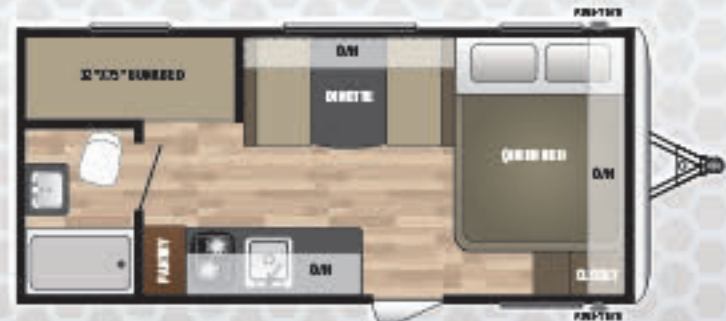
WEIGHT LENGTH 1800BH 3285 21'5"