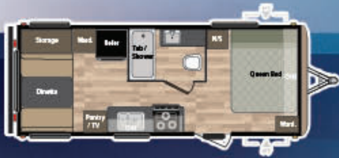
WEIGHT 3983 LENGTH 21' 10" 179QBWE