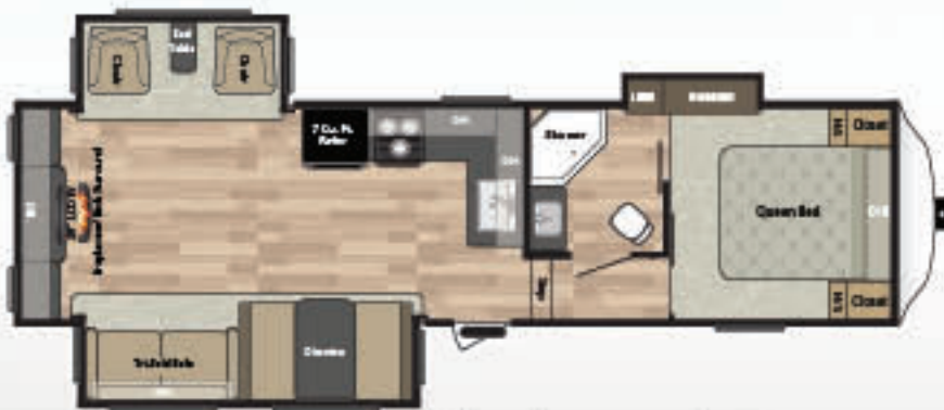
WEIGHT 8493 LENGTH 32' 10" 253FWRE