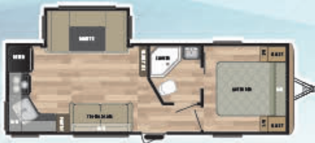
WEIGHT 5784 LENGTH 28' 6" 242RKWE