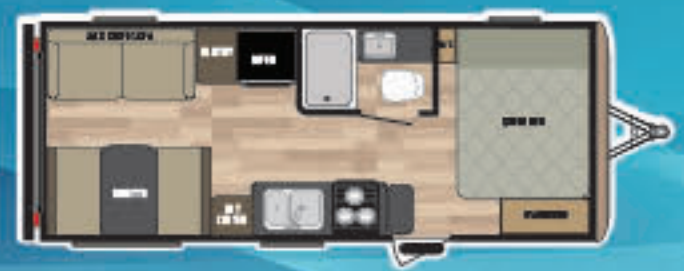
WEIGHT 4307 LENGTH 24' 201RDWE