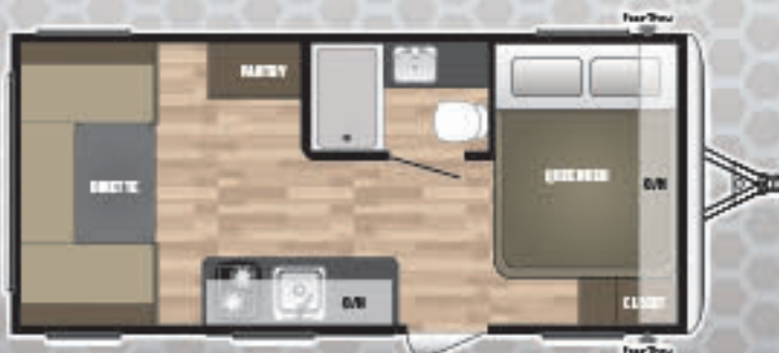
WEIGHT LENGTH 1750RD 3295 21'5"