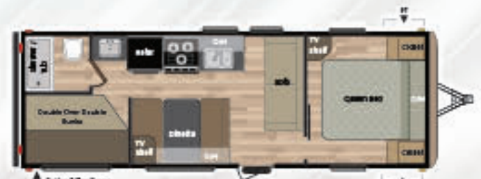
WEIGHT 4883 LENGTH 28' 6" 260TBWE

Springdale's bunk house models offer you great options to match any of your family needs. We've built our bunkrooms with plenty of storage for all the clothes and toys. Best of all, everyone has their own space when it's time to settle in for the night. The perfect lineup of floorplans for your family, kids, grand-children, friends. Everyone fits with room to spare in a Springdale bunk house.