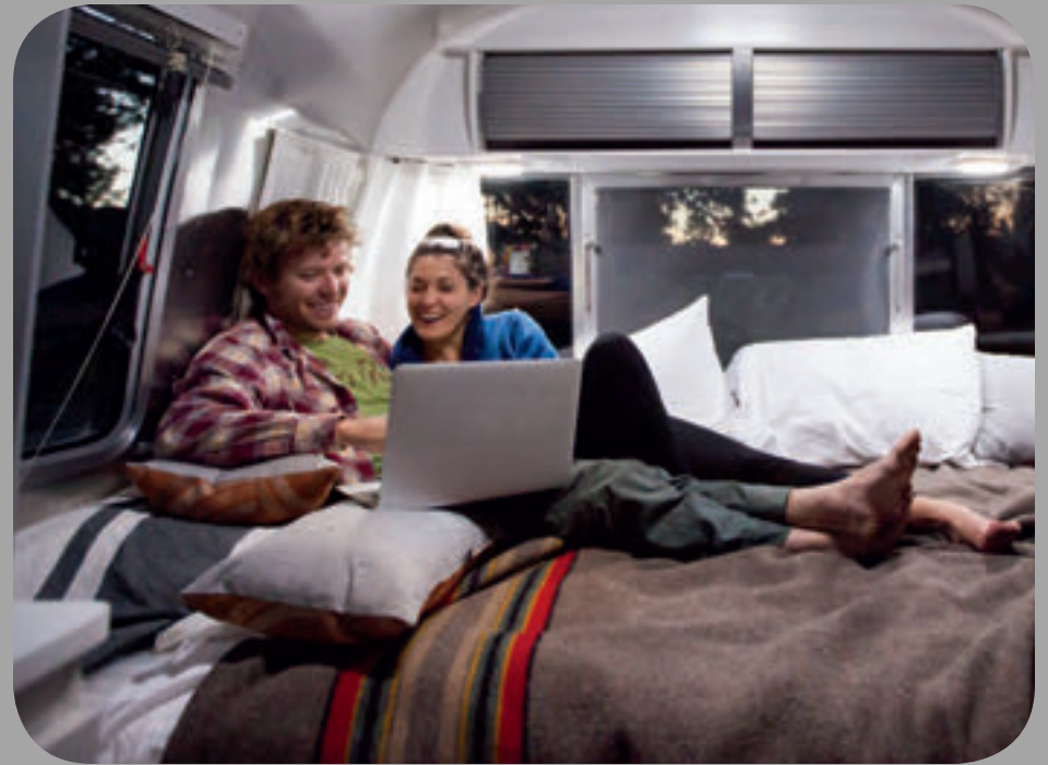
Sleep, watch a movie or relive the day's adventures in the spacious, cozy queen bed.