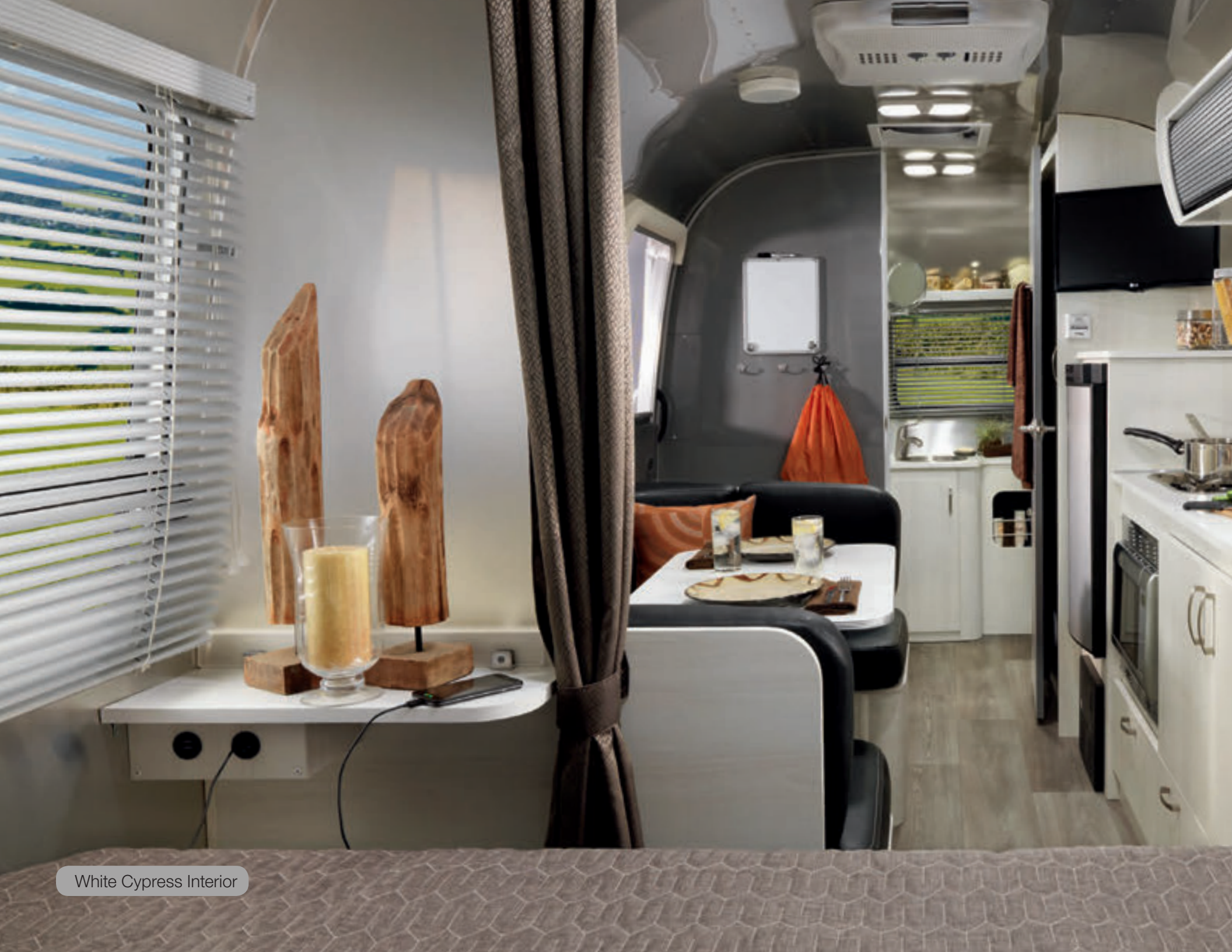
White Cypress Interior