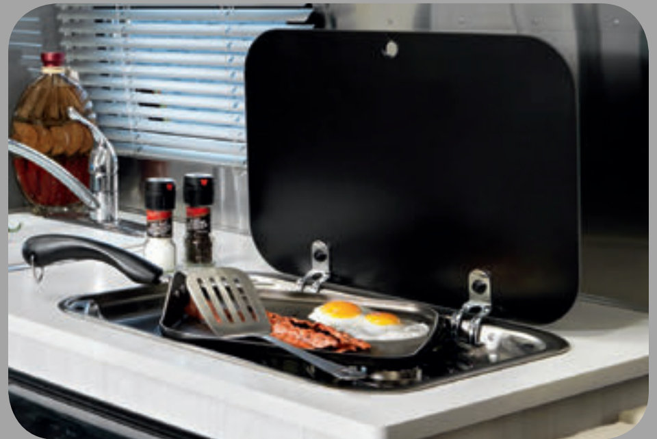
Two burners, infinite possibilities in the Sport's kitchen.