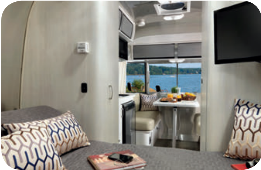
White Cypress: Tan Ultraleather®