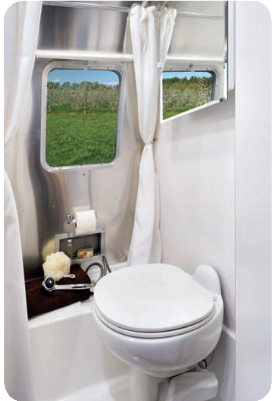
Bathe in natural light. Literally.