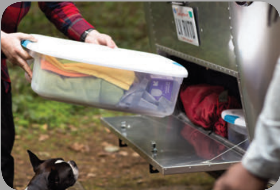
Stow gear and other bulk items in the convenient outdoor storage locker.