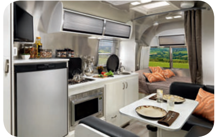
White Cypress: Black Ultraleather®