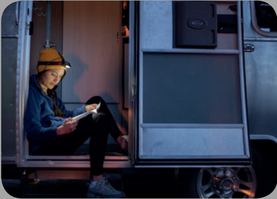
Read under the stars, by the light of the cabin, or a little bit of both.