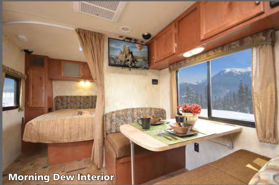
Morning Dew Interior