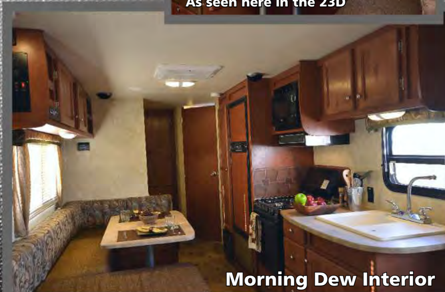
Morning Dew Interior