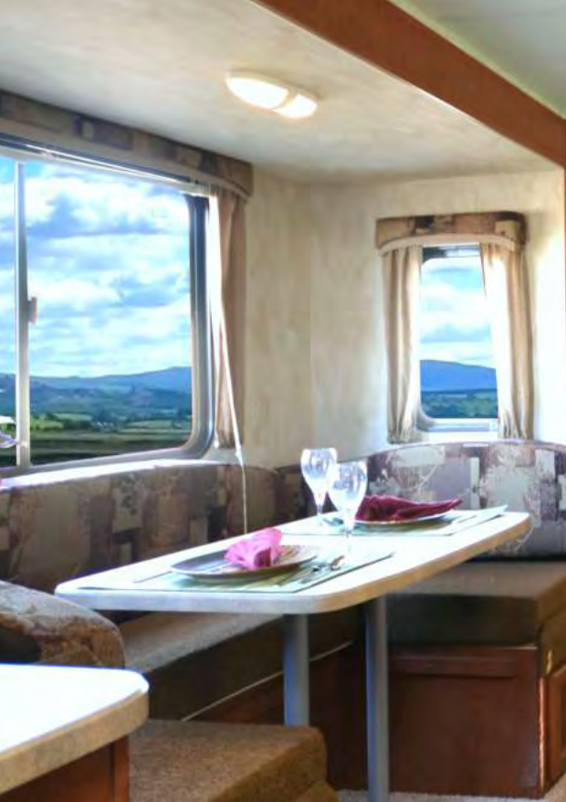
25C High Desert