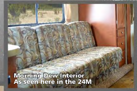
Morning Dew Interior As seen here in the 24M