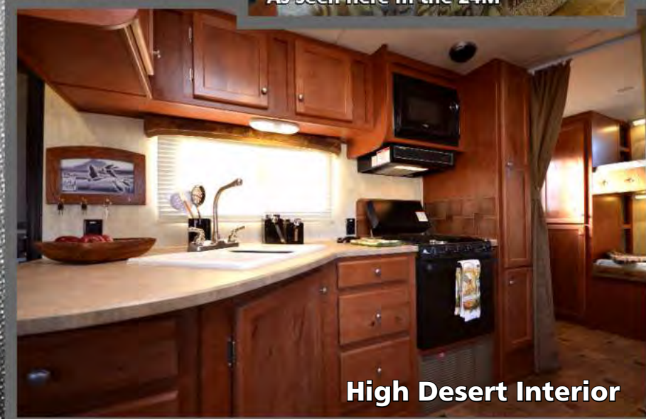
High Desert Interior