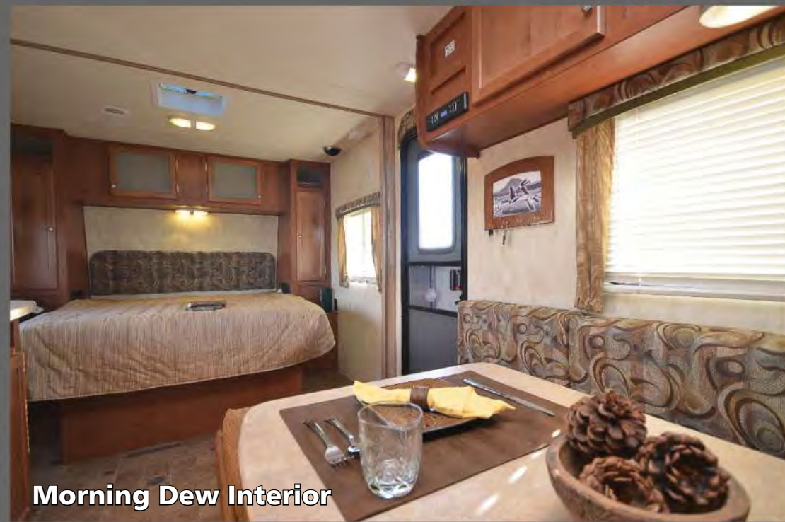
Morning Dew Interior