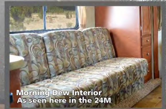
Morning Dew Interior As seen here in the 24M