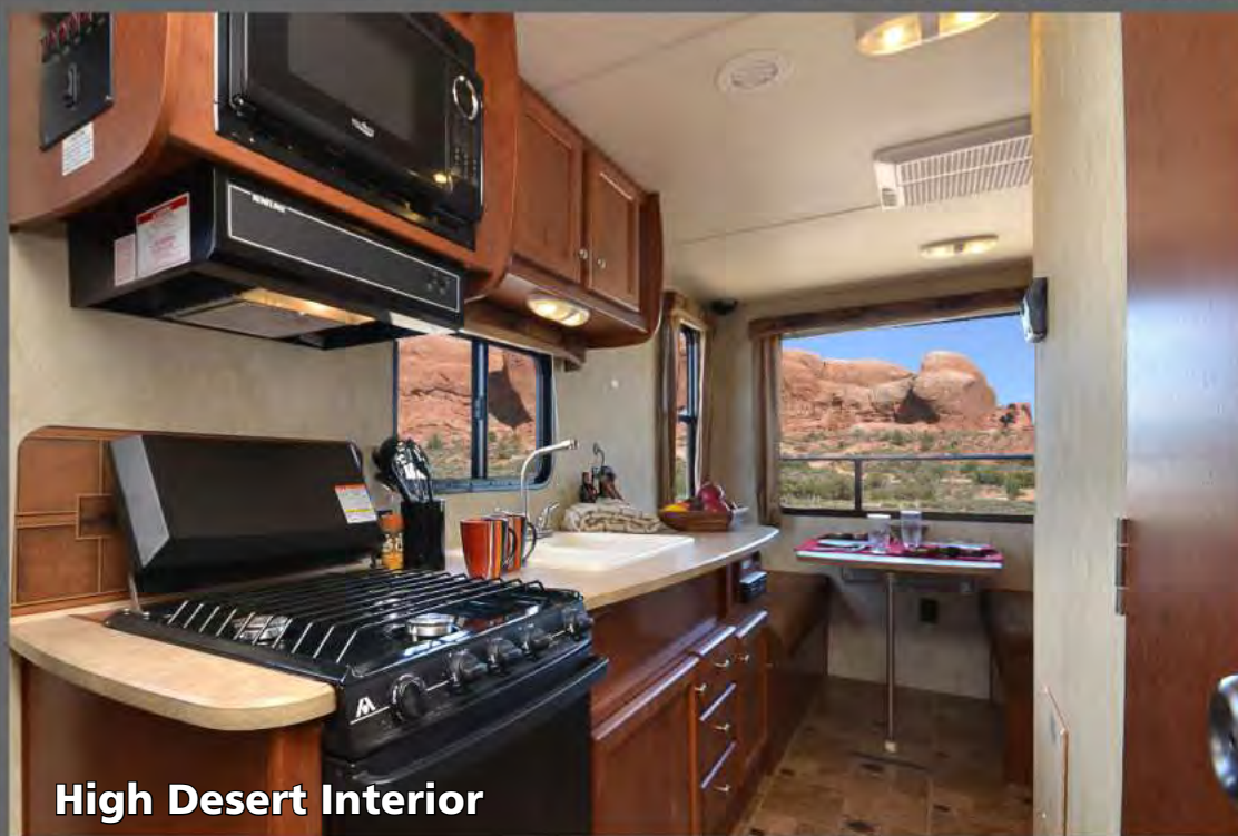
High Desert Interior