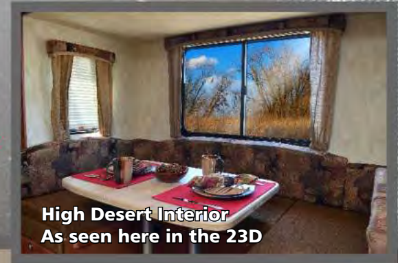
High Desert Interior As seen here in the 23D