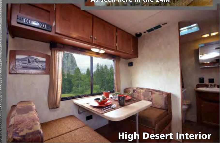
High Desert Interior