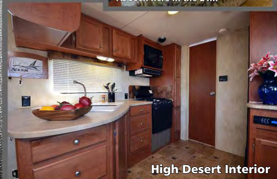
High Desert Interior