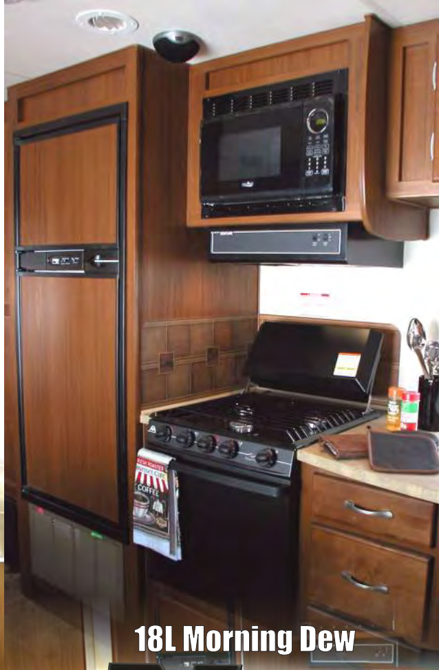
18L Morning Dew