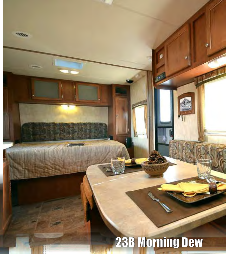
23B Morning Dew