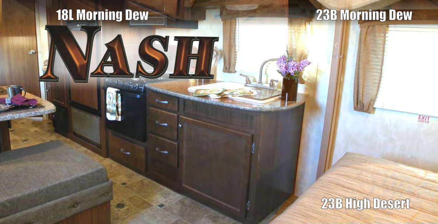
23B High Desert