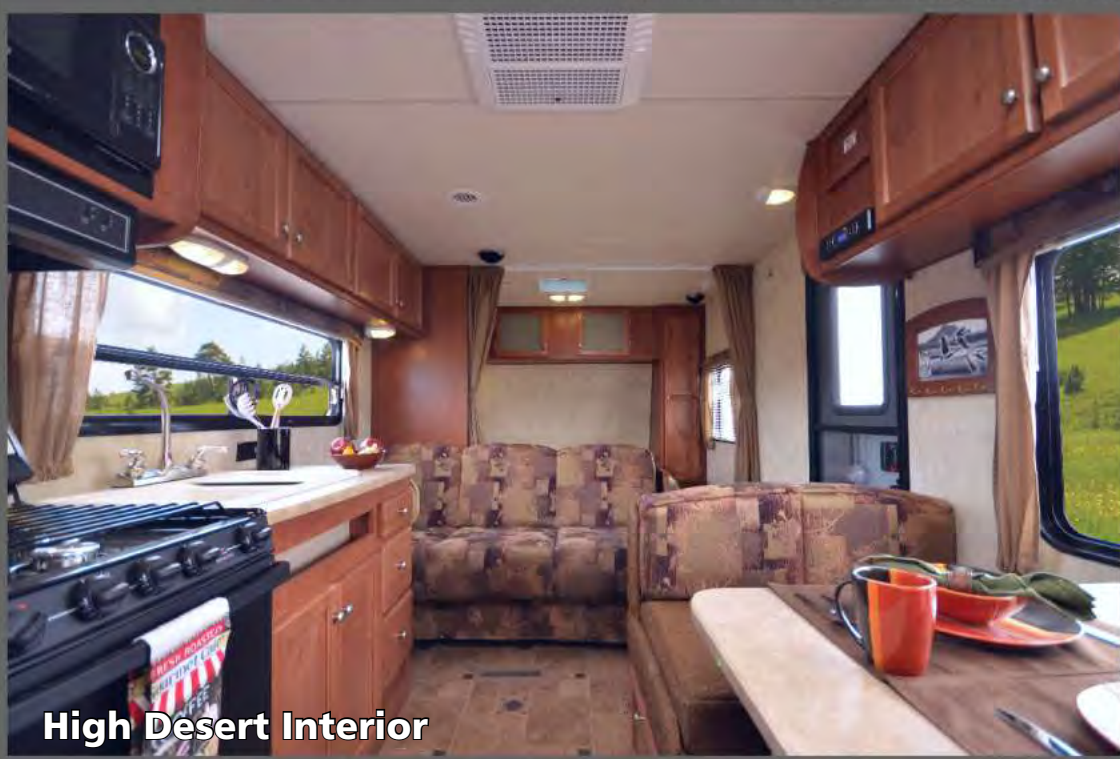
High Desert Interior