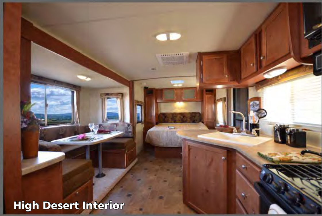
High Desert Interior