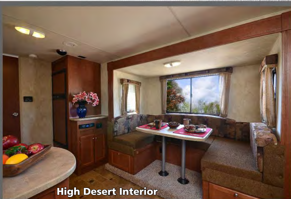
High Desert Interior