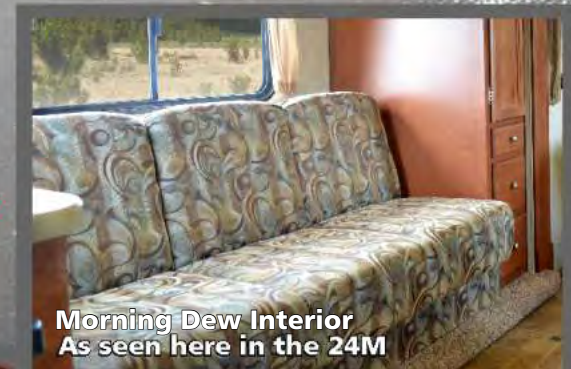
Morning Dew Interior As seen here in the 24M