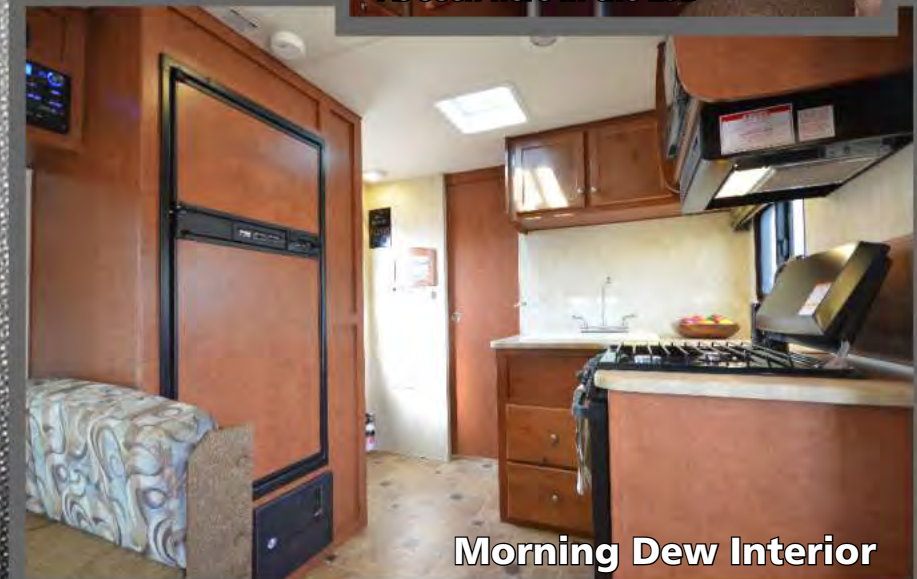
Morning Dew Interior