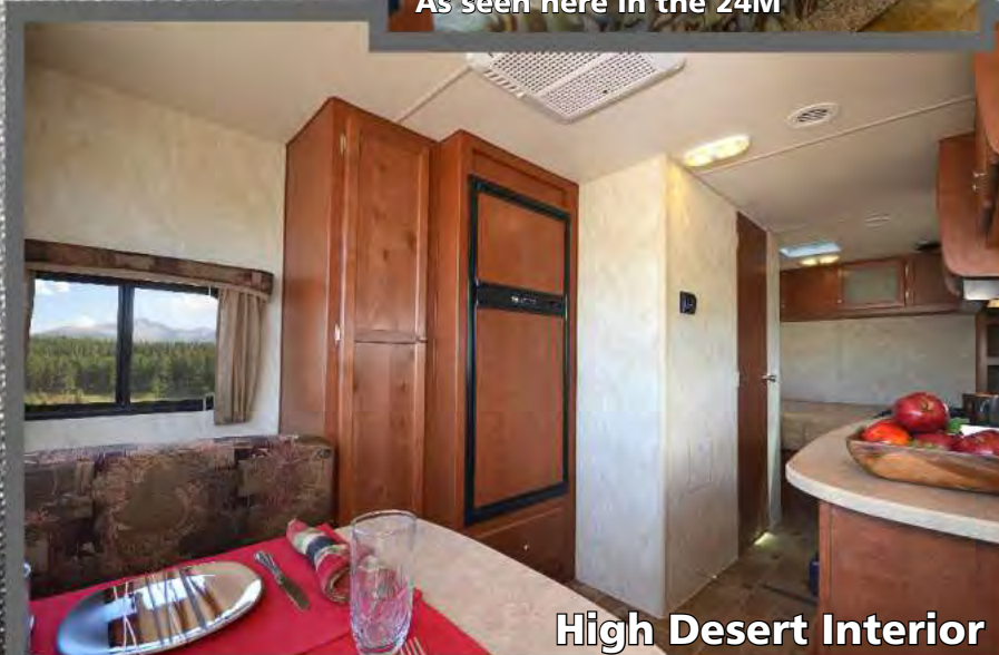
High Desert Interior