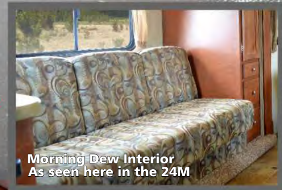
Morning Dew Interior As seen here in the 24M