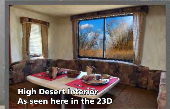
High Desert Interior As seen here in the 23D