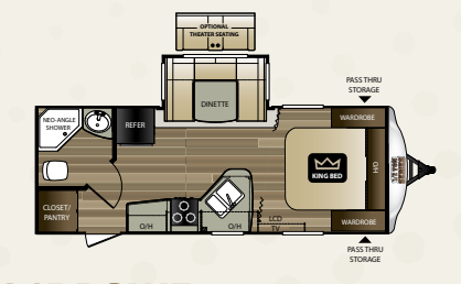
21 RBSWE LENGTH: 25' 11" WEIGHT: 5,380