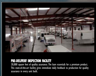
PRE-DELIVERY INSPECTION FACILITY 20,000 square feet of quality assurance. The bare essentials for a premium product. This state-of-the-art facility gives immediate daily feedback to production for quality assurance in every unit built.