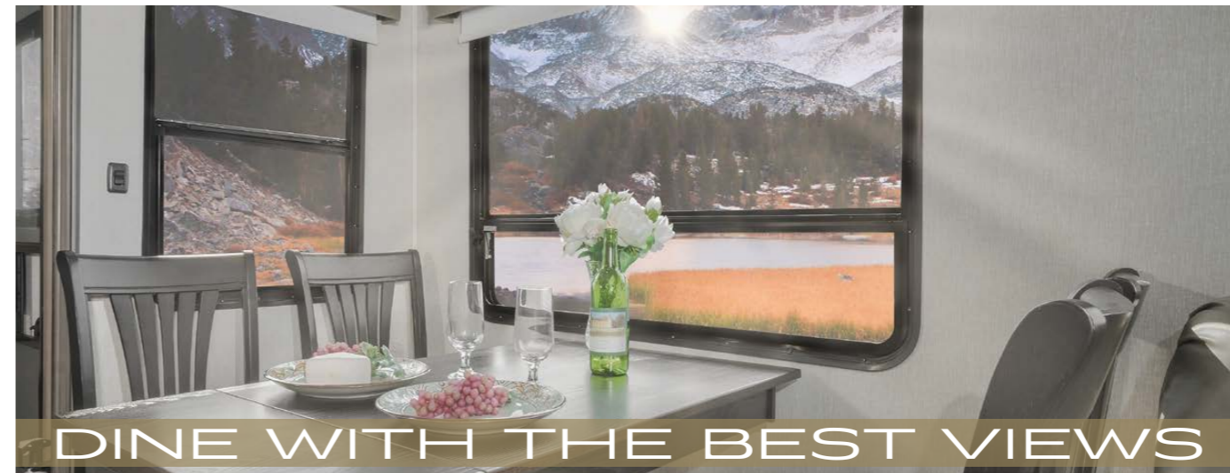
DINE WITH THE BEST VIEWS