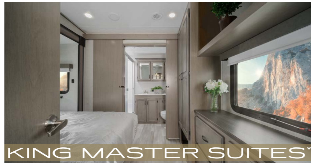
KING MASTER SUITES*