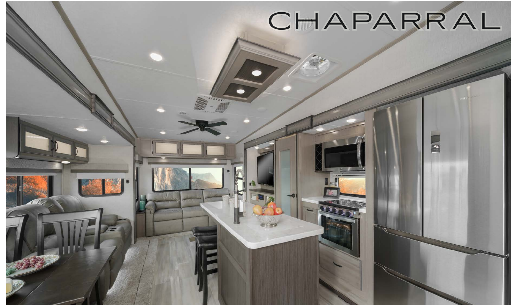
Kitchen & Dining Area, 336TSIK