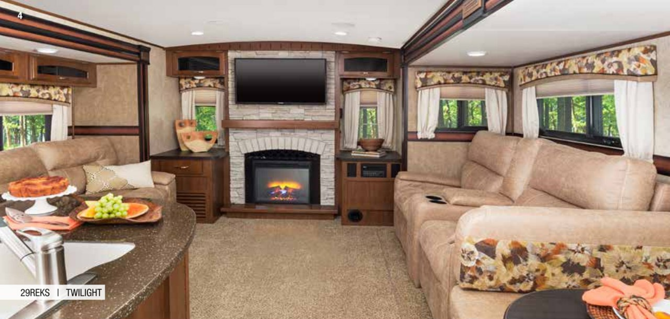
29REKS | TWILIGHT