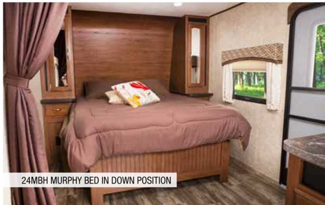
24MBH MURPHY BED IN DOWN POSITION