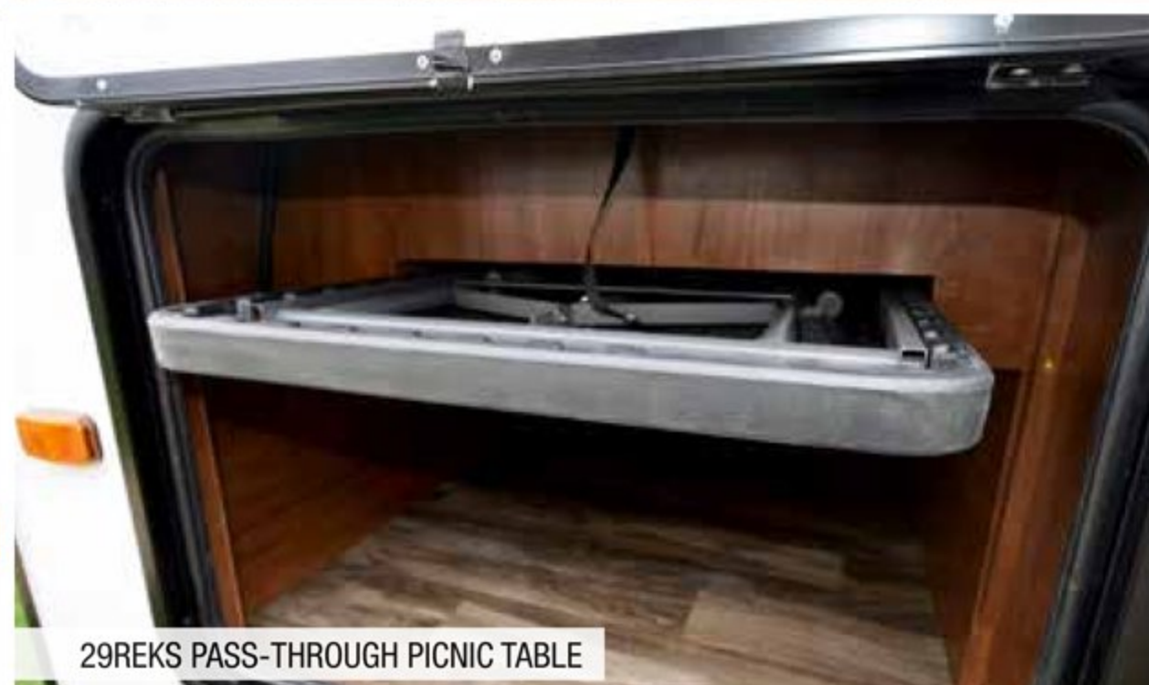
29REKS PASS-THROUGH PICNIC TABLE