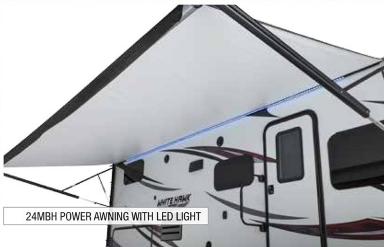
24MBH POWER AWNING WITH LED LIGHT