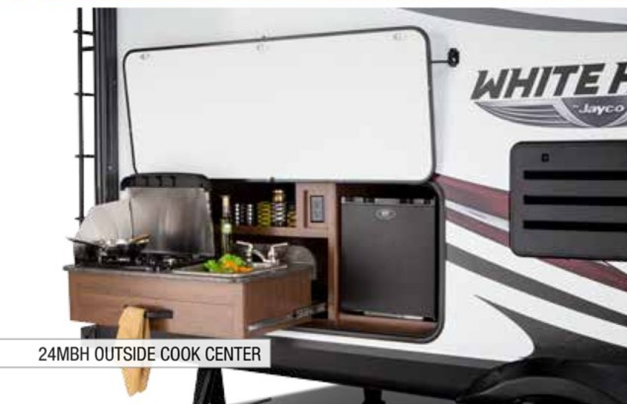
24MBH OUTSIDE COOK CENTER