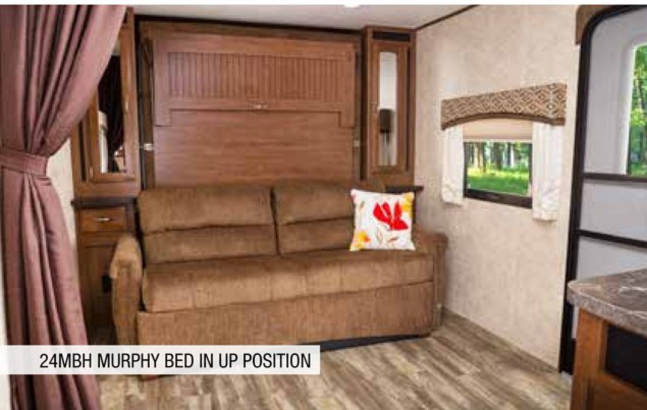
24MBH MURPHY BED IN UP POSITION

Take your camping experience to new heights. Thoughtful floorplans and standard slideouts pack value and comfort in a strong, lightweight package.