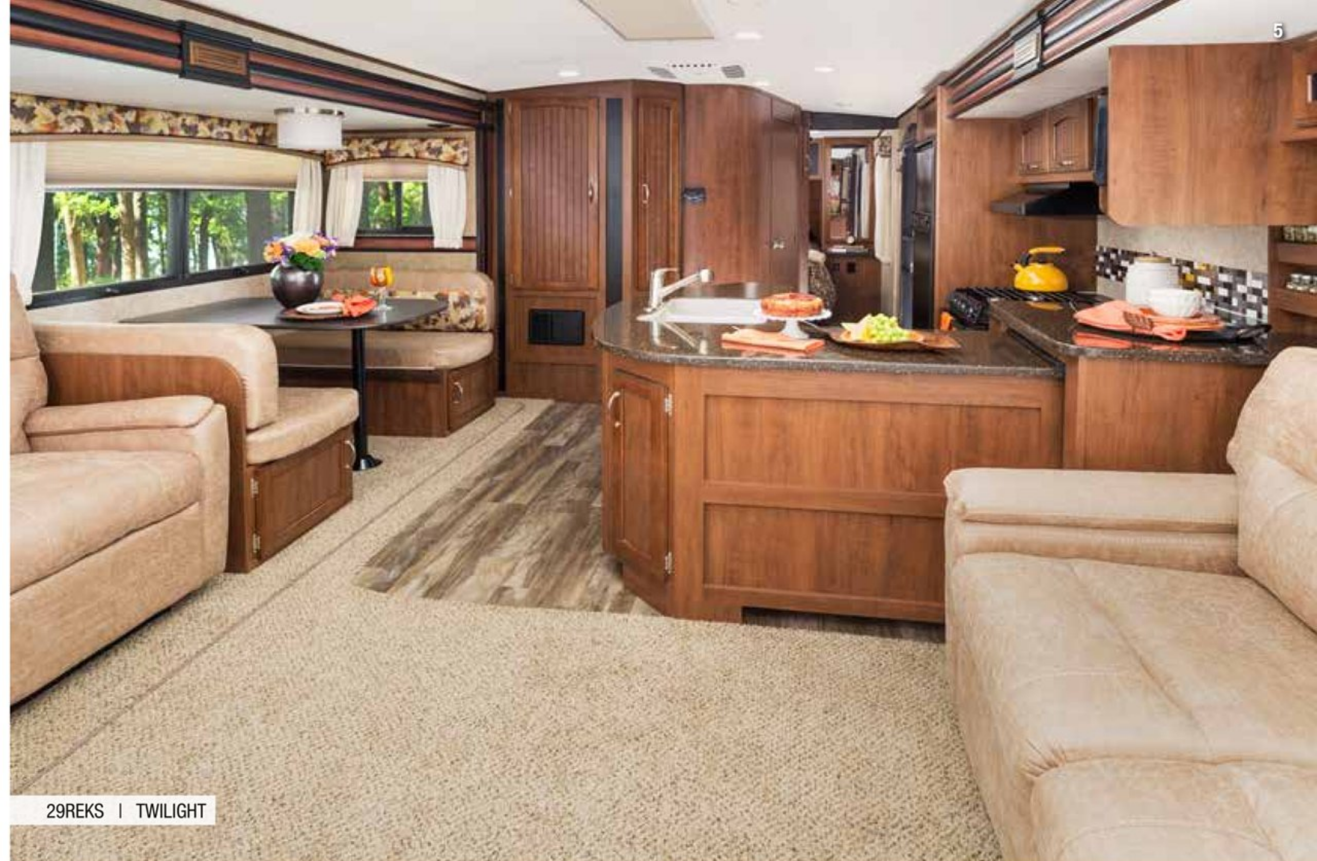
29REKS | TWILIGHT