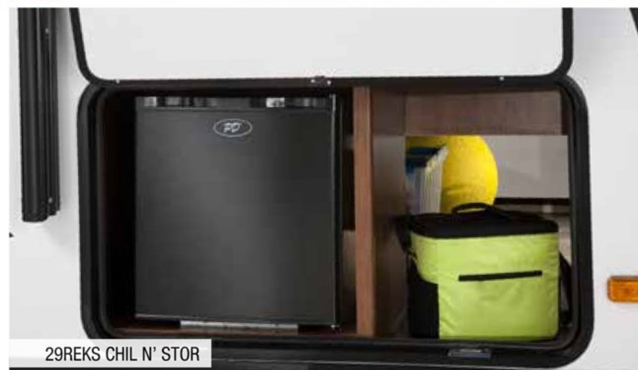
29REKS CHIL N' STOR