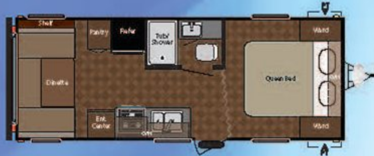
WEIGHT: 4292 LENGTH: 24' 10" 202QBWE