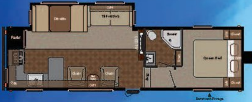
WEIGHT: 7291 LENGTH: 31' 11" • 280FWRK