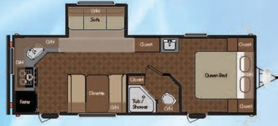
WEIGHT: 5651 LENGTH: 28' 2" 241RKWE