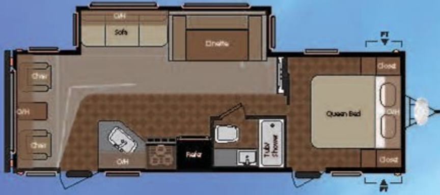
WEIGHT: 6223 LENGTH: 28' 11" 266RLWE