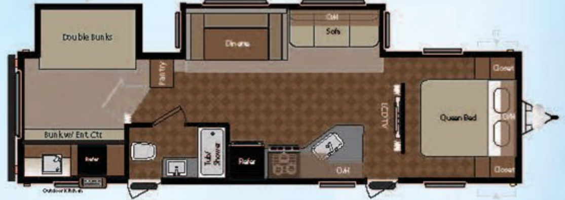
WEIGHT: 7720 LENGTH: 34' 11" 303BHWE