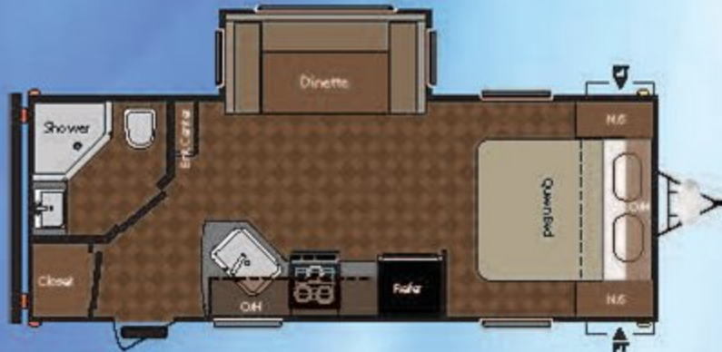
WEIGHT: 5324 LENGTH: 25' 11" 212RBWE