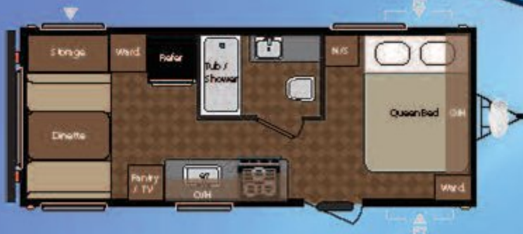
WEIGHT: 3991 LENGTH: 21' 10" 179QBWE