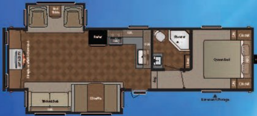
WEIGHT: 8065 LENGTH: 31' 11" • 253FWRE