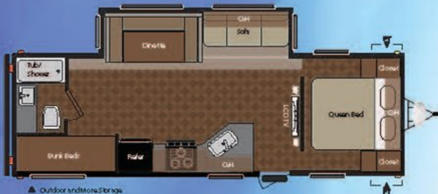
WEIGHT: 6116 LENGTH: 28' 11" 267BHWE