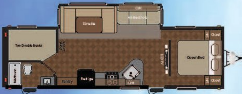
WEIGHT: 6699 LENGTH: 32' 1" 282BHWE