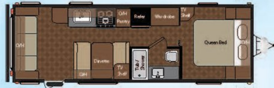
WEIGHT: 4751 LENGTH: 27' 11" 256RLWE