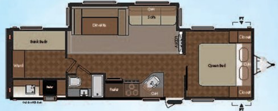
WEIGHT: 6882 LENGTH: 32' 7" 294BHWE