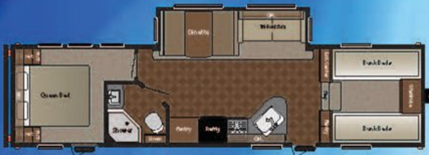
WEIGHT: 7842 LENGTH: 34' 5" • 320FWFB