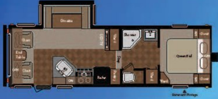
WEIGHT: 6439 LENGTH: 27' 8" • 247FWRL