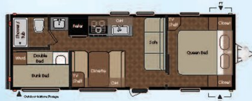
WEIGHT: 4843 LENGTH: 28' 6" 260TBWE