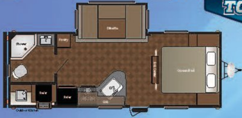
WEIGHT: 5677 LENGTH: 26' 3" 225RBWE