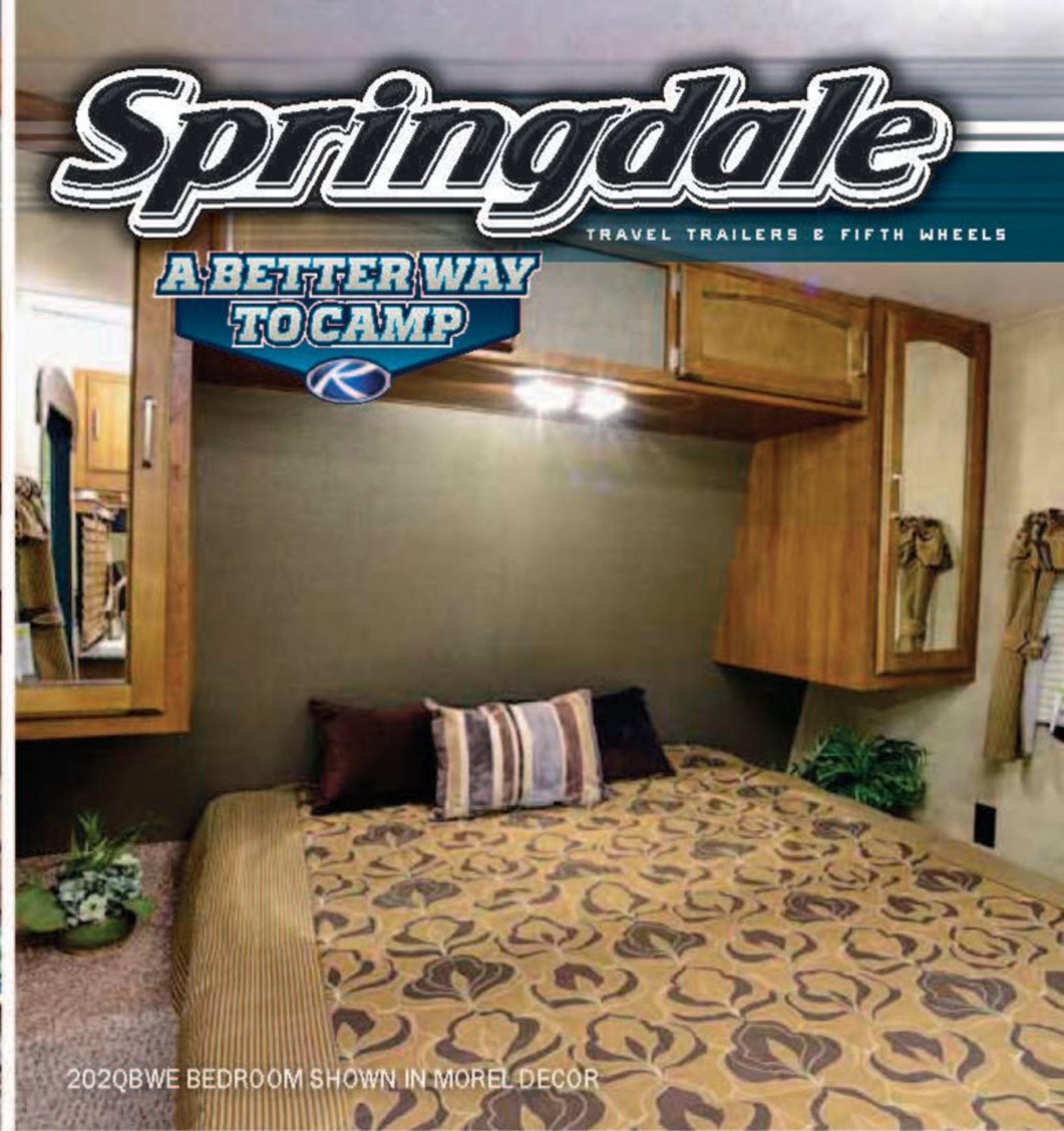
202QBWE BEDROOM SHOWN IN MOREL DECOR