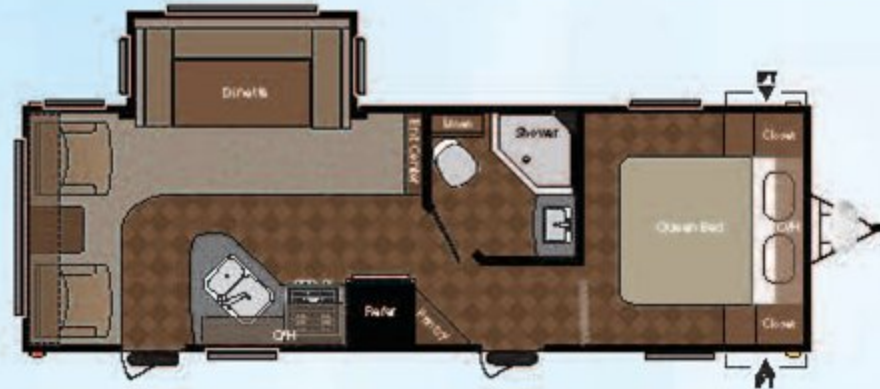
WEIGHT: 6070 LENGTH: 29' 7" 258RLWE