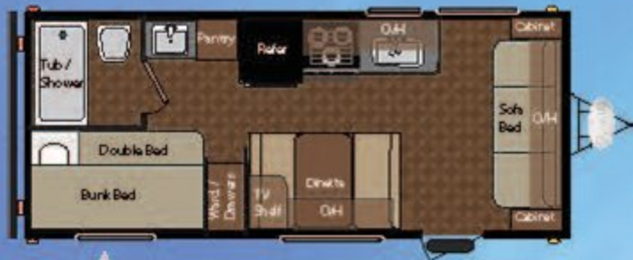
WEIGHT: 4182 LENGTH: 23' 7" 189FLWE