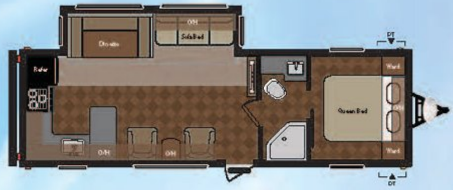
WEIGHT: 6729 LENGTH: 32' 11" 293RKWE