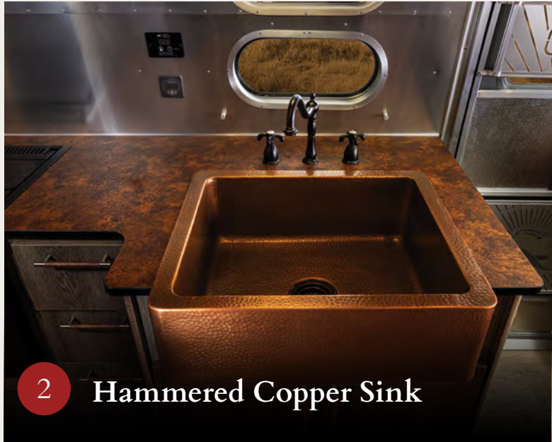
2 Hammered Copper Sink

Authentic touches make this trailer genuine to its roots