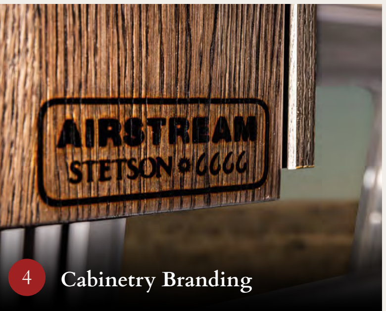
4 Cabinetry Branding

Bring along your own personal watering hole