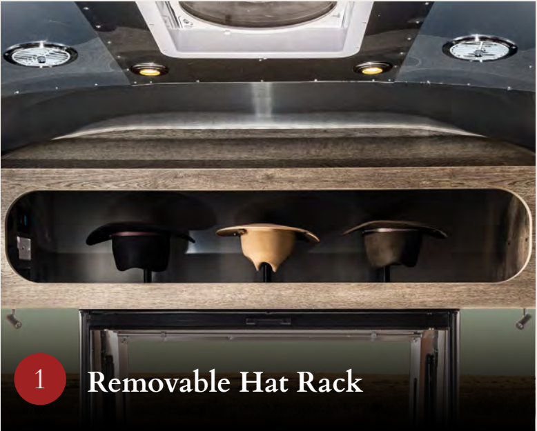
1 Removable Hat Rack

Authentic touches make this trailer genuine to its roots