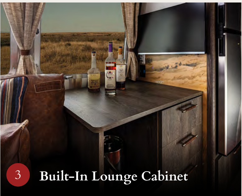
3 Built-In Lounge Cabinet

Handsome details and finishes contribute to the overall ambiance