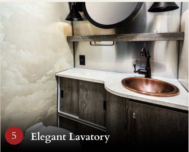
5 Elegant Lavatory

Elegant design elements included throughout the interior