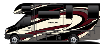
Premium Paint - Pinehurst