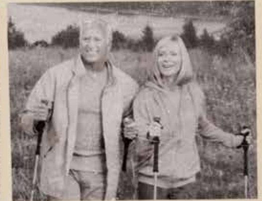
Mom & Dad hittin' the trails Big Bend '89