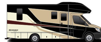
Premium Paint - Merlot