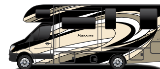
Premium Paint - Waterville