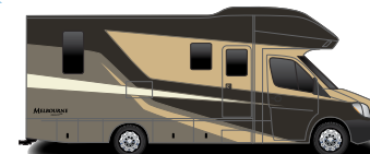
Premium Paint - Hollywood