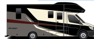
Premium Paint - Canyon