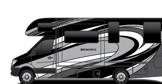
Premium Paint - Muirfield