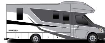
Premium Paint - Phantom