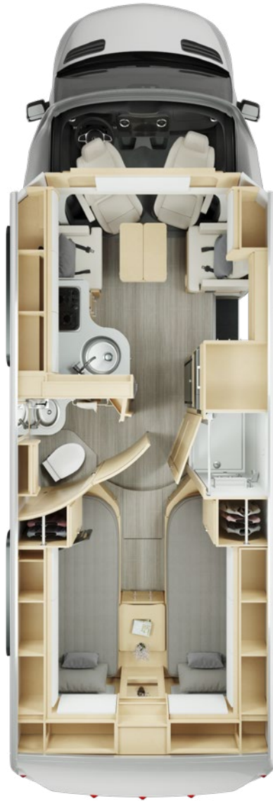
U24TB | Twin Bed