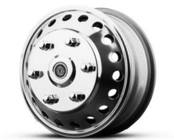
Steel Wheels Standard – With Wheel Simulators