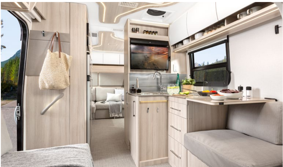
Cashmere (Exclusive to the Unity Rear Lounge) Shown with Bianco White Fenix Glamour Upgrade