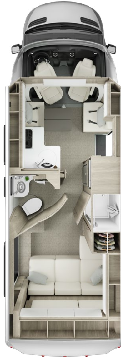
U24RL | Rear Lounge