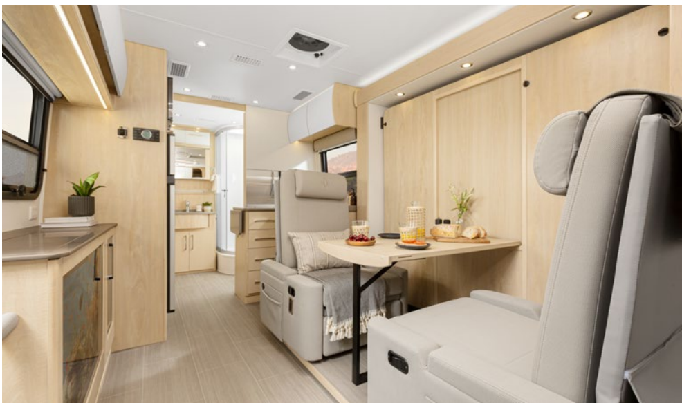
Sierra Maple Shown with Bianco White Fenix Glamour Upgrade