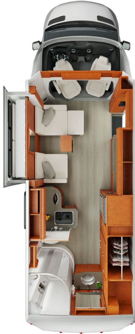
U24MB | Murphy Bed (Shown with standard Leisure Lounge)