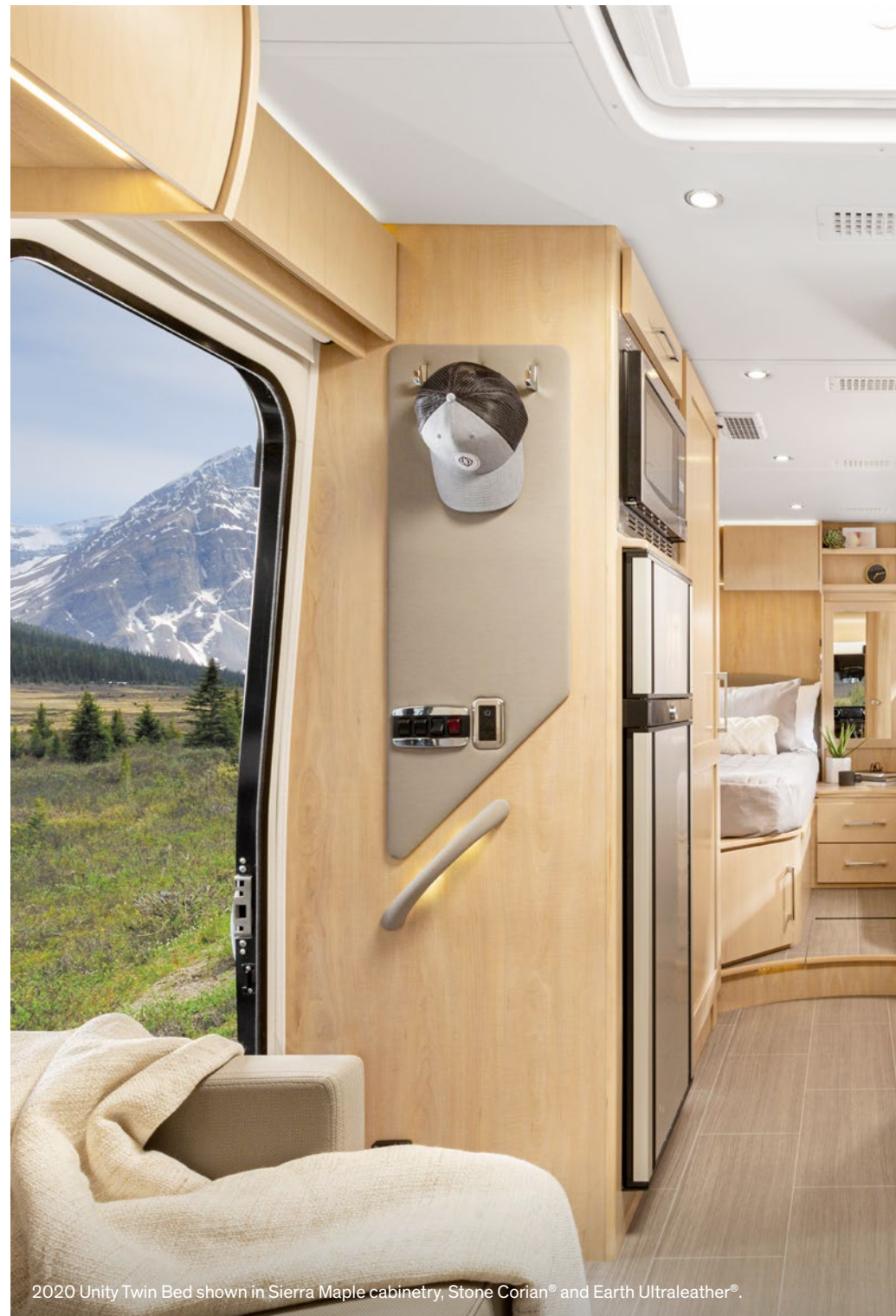
2020 Unity Twin Bed shown in Sierra Maple cabinetry, Stone Corian® and Earth Ultraleather®.