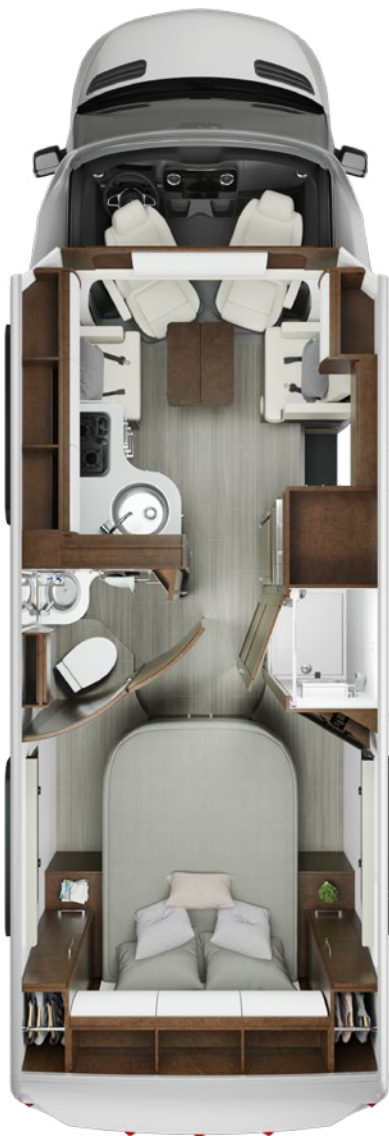
U241B | Island Bed