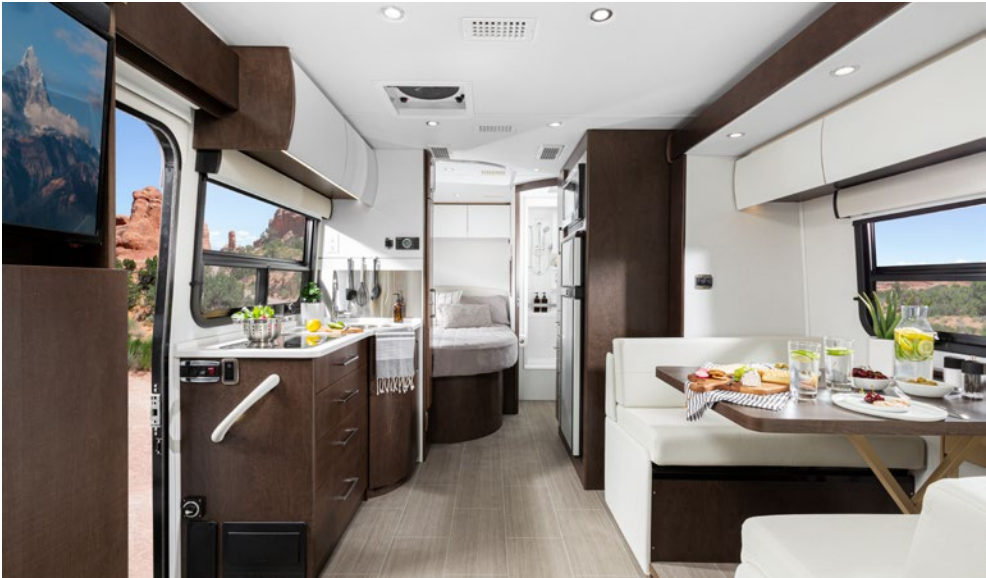
Espresso Brown Shown with Bianco White Fenix Glamour Upgrade