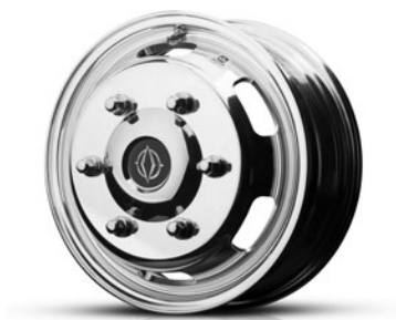
Alcoa Dura-Bright® Aluminum Wheels Optional – All 6 Aluminum Wheels, 4 Dura-Bright® Wheels