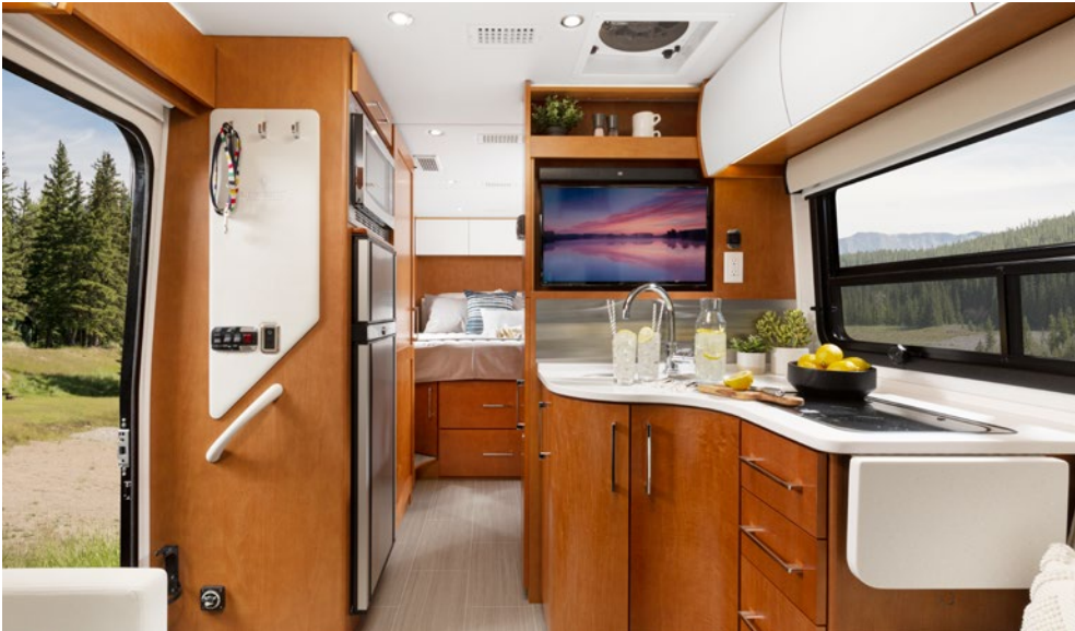
Chestnut Cherry Shown with Bianco White Fenix Glamour Upgrade