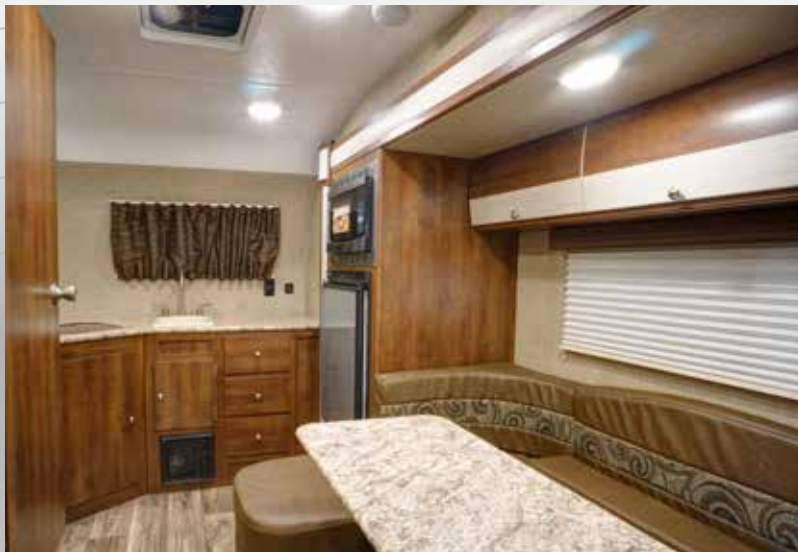
170RKRV SHOWN IN DRIFTWOOD DECOR