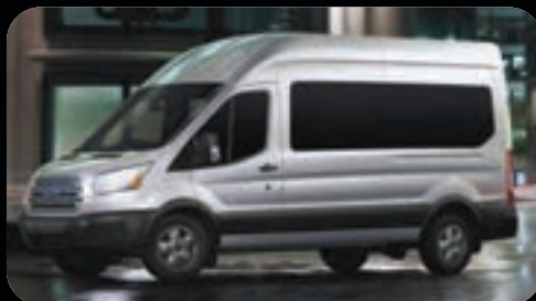
Ingot Silver exterior paint now available