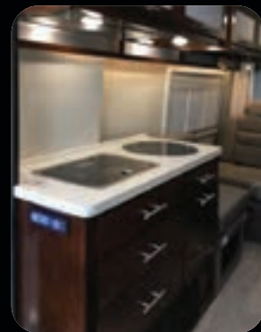
High Gloss Cherry cabinetry