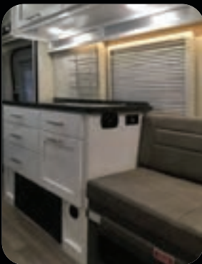
High Gloss White cabinetry

This versatile Class B motorhome is designed for today's active lifestyles. Experience unrivaled fuel economy combined with legendary Ford® styling and reliability. Relax in luxurious captains seats while enjoying the view through large frameless windows. The interior ergonomics ensure you are as comfortable on the road as you are at home. Beyond gets you where the action is, in style!