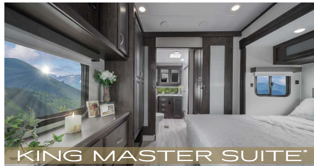
KING MASTER SUITE*