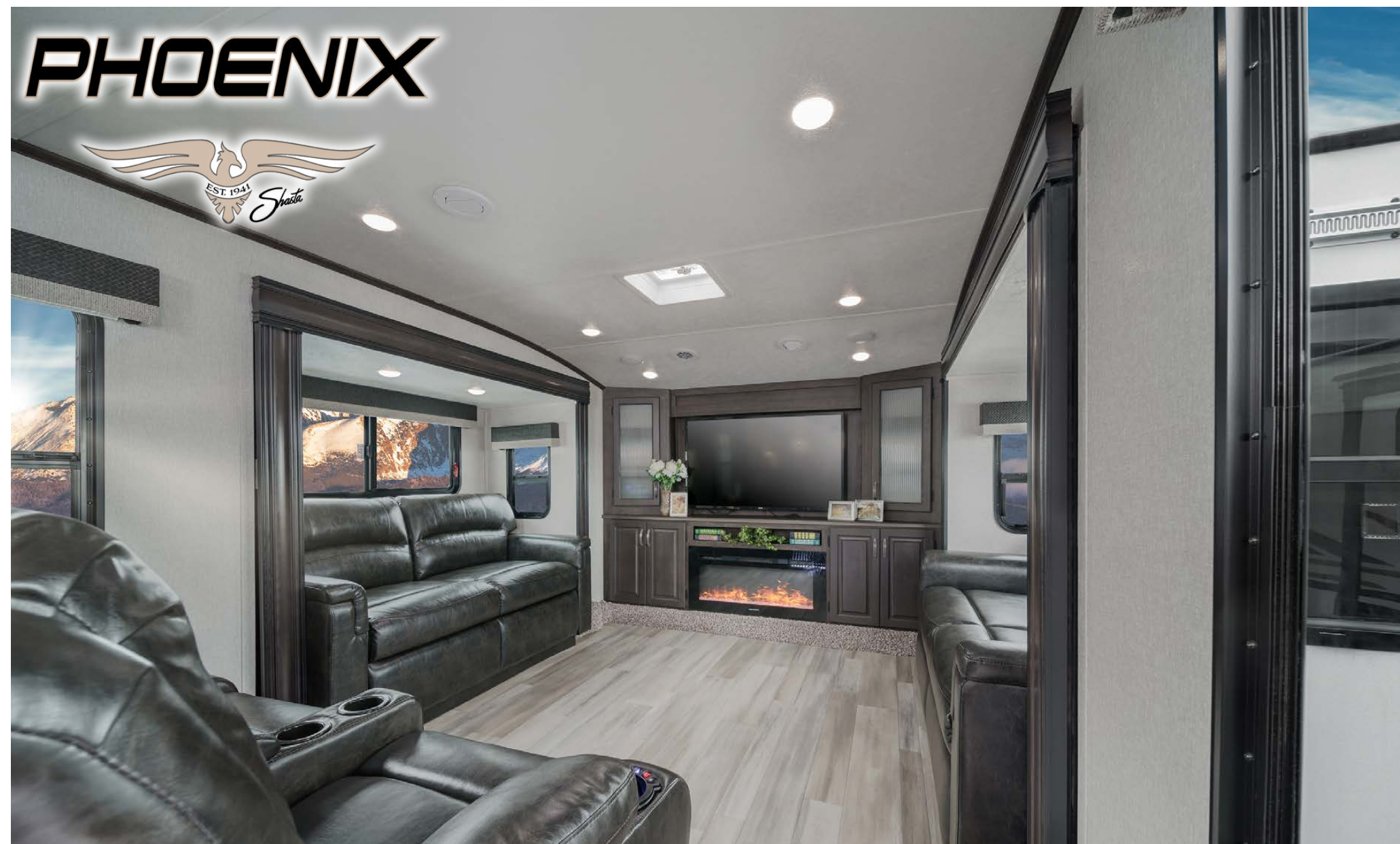
Spacious FL w/ Dual Hide-A-Beds & Theatre Seating w/ Heat, LED, & Massage, 334FL