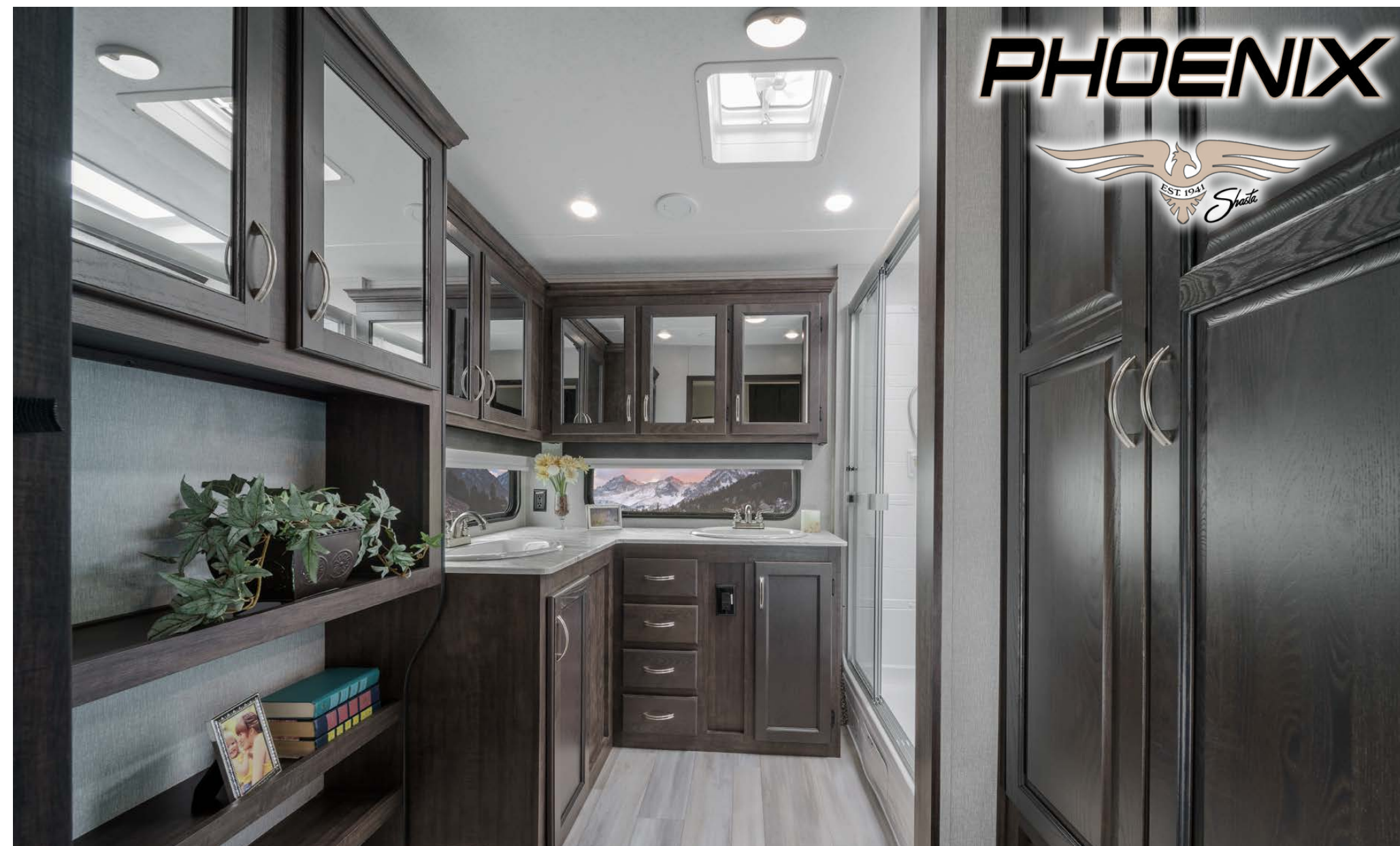
Dual Lav Bath Suite w/ XL Stackable Washer/Dryer Closet - 334FL