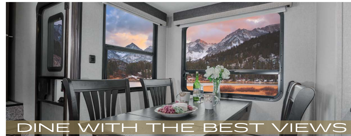
DINE WITH THE BEST VIEWS