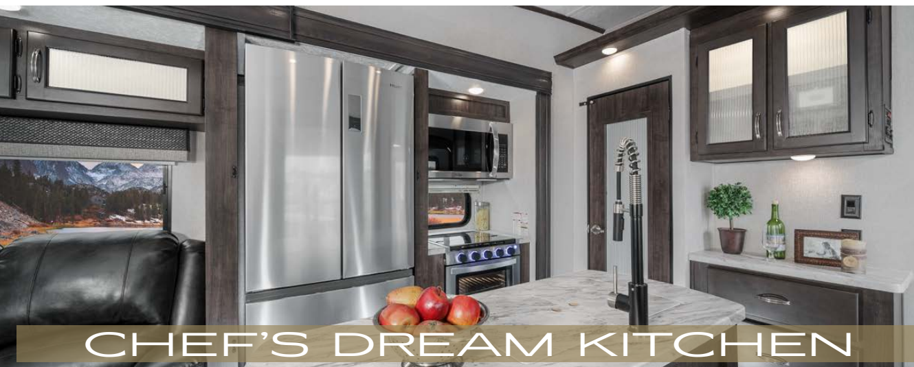
CHEF'S DREAM KITCHEN