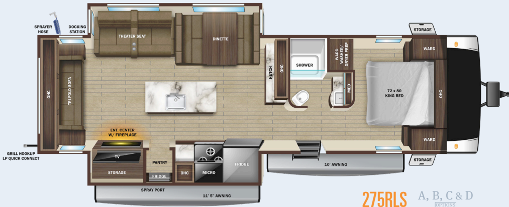
275RLS A, B, C & D