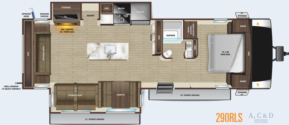
290RLS A, C & D