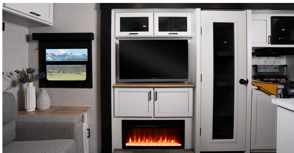
2025 Light 290RLS