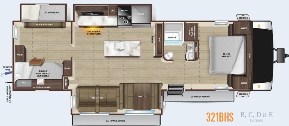
321BHS B, C, D & E