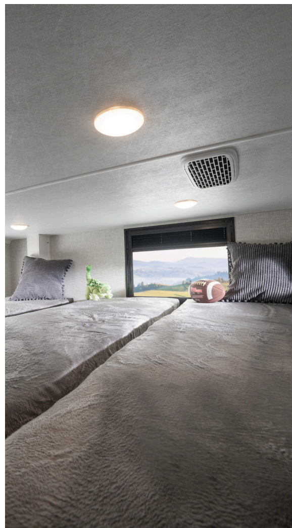
2025 Open Range 3X 390TBS FW