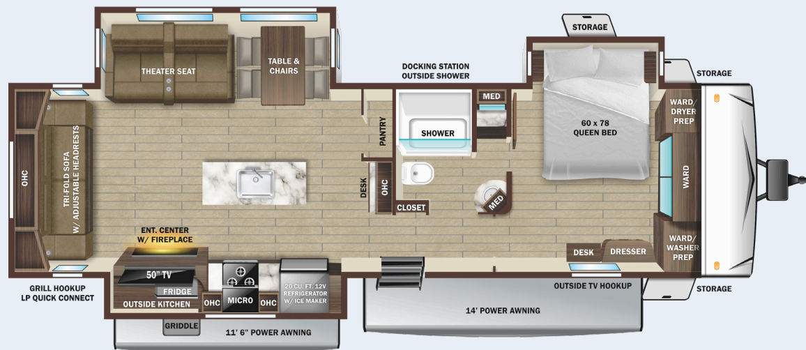
322RLS B & C