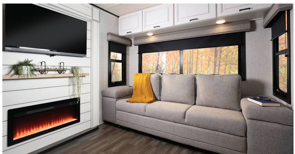
2025 Open Range 322RLS