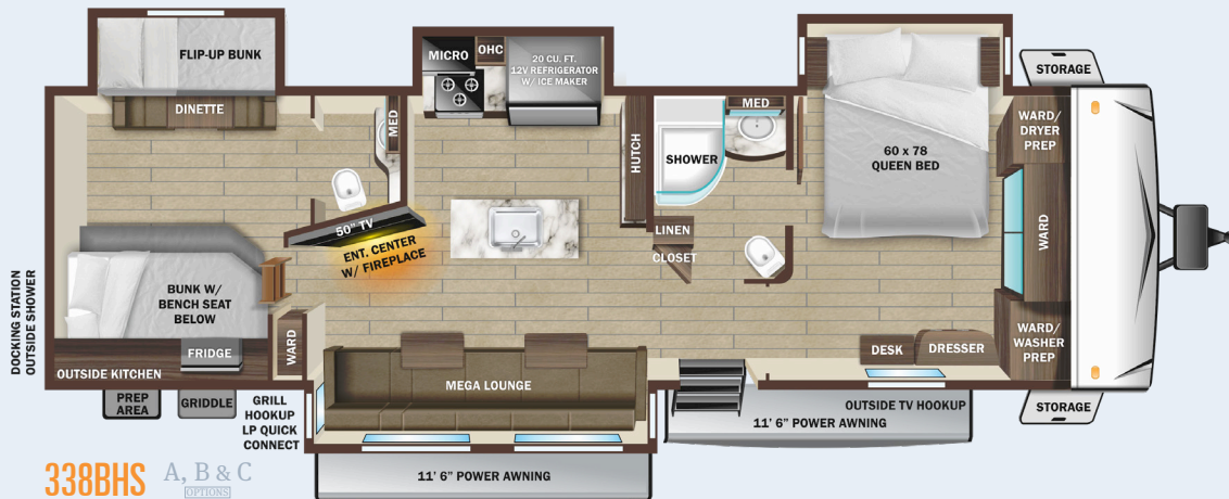
338BHS A, B & C