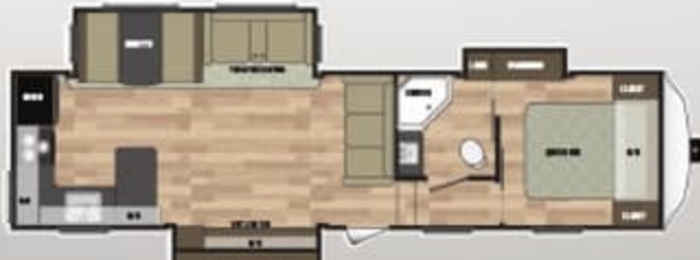
WEIGHT 8880 LENGTH 33' 9" 302FWRK