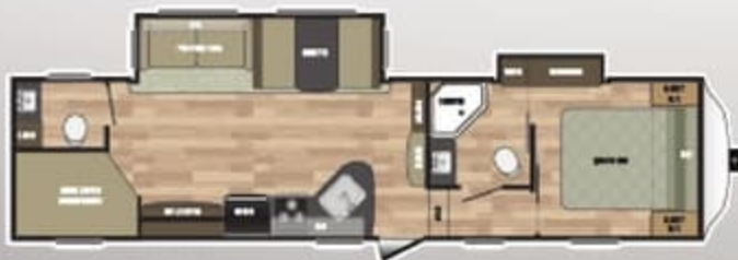
WEIGHT 8595 LENGTH 34' 10" 300FWBH