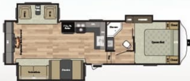
WEIGHT 8493 LENGTH 32' 10" 253FWRE