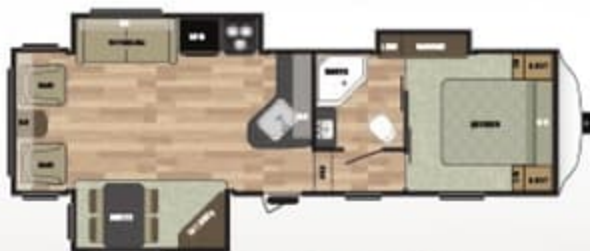
WEIGHT 8157 LENGTH 31' 278FWRL