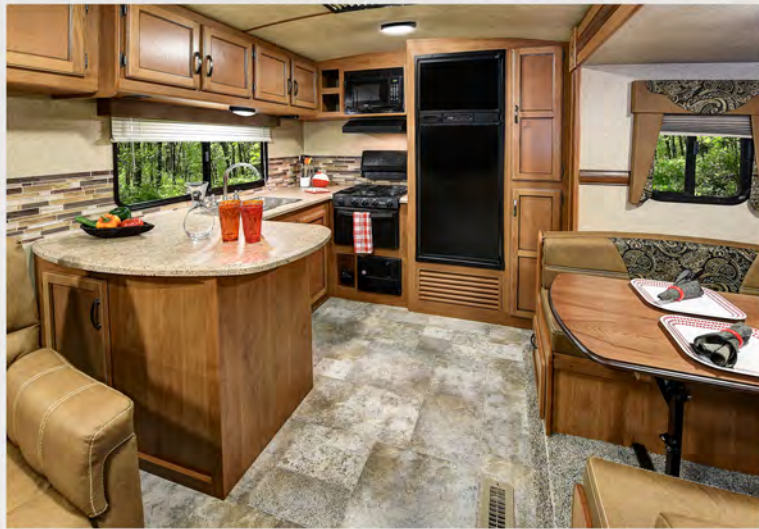
300RK Kitchen & Dinette Booth