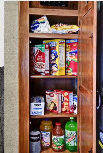
320BH Entryway Storage used as pantry