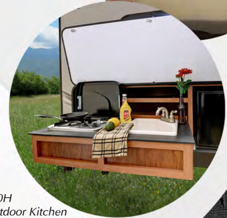
270H Outdoor Kitchen