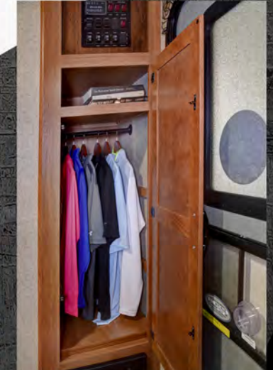
320BH Entryway storage used as closet space

*All Pantries include a hanging rod and adjustable shelving.