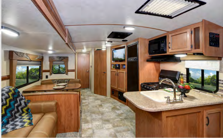
260RL Kitchen and Dinette Booth