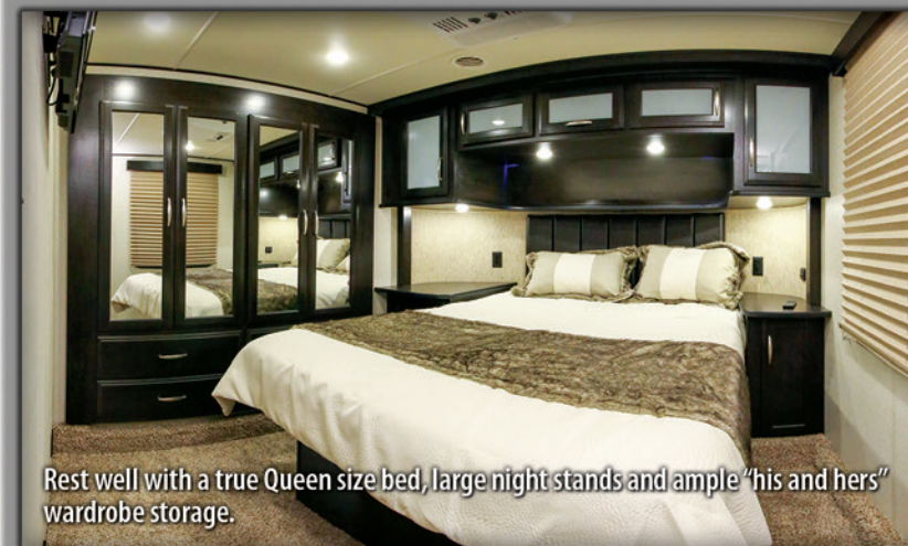
Rest well with a true Queen size bed, large night stands and ample "his and hers" wardrobe storage.