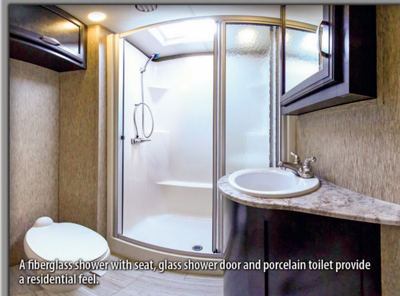
A fiberglass shower with seat, glass shower door and porcelain toilet provide a residential feel.