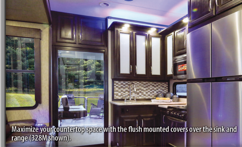
Maximize your countertop space with the flush mounted covers over the sink and range (328M shown).