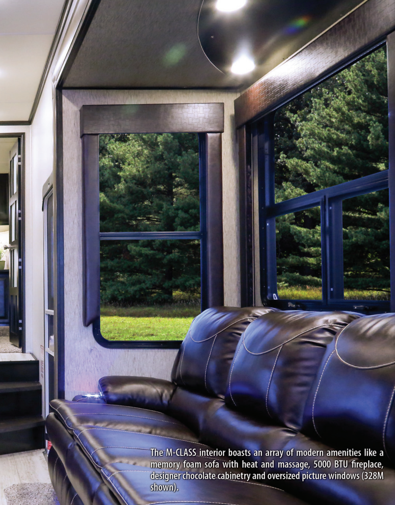
The M-CLASS interior boasts an array of modern amenities like a memory foam sofa with heat and massage, 5000 BTU fireplace, designer chocolate cabinetry and oversized picture windows (328M shown).