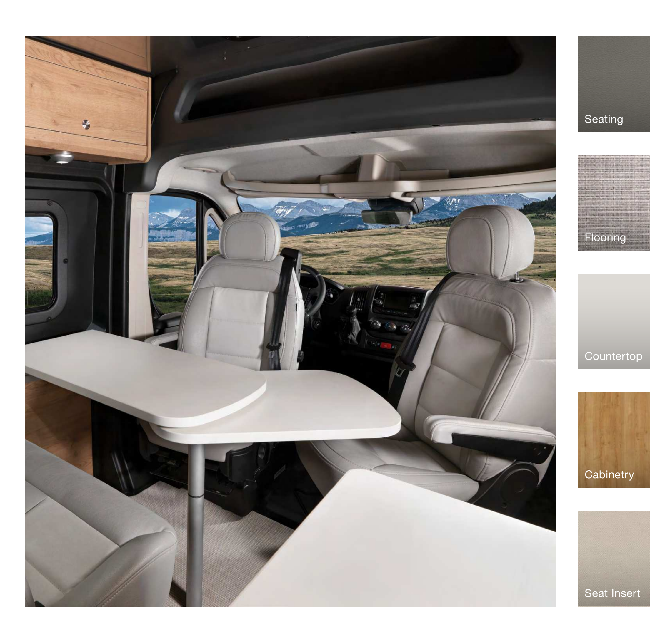
River Oak with Moonstone Grey Seating