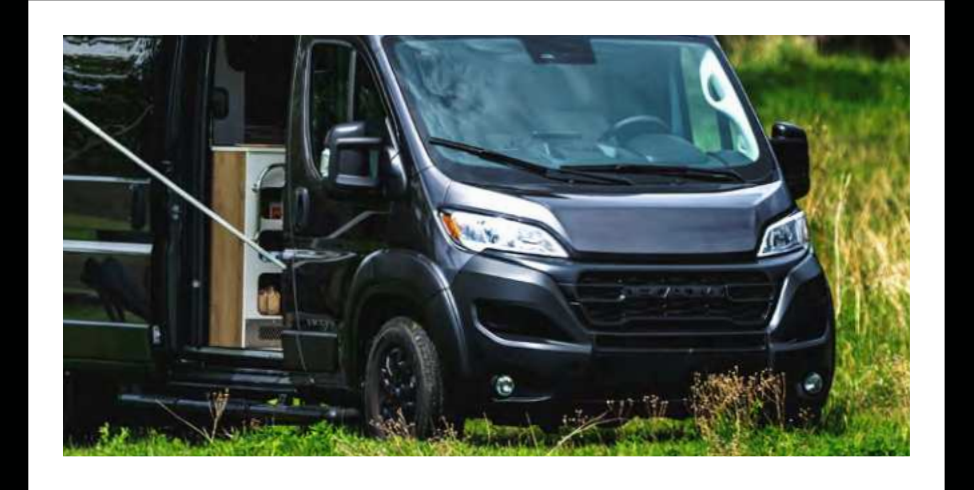
The sleek automotive design features a matte black front grille.