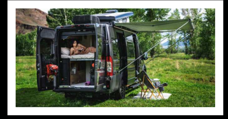
A 12-foot awning with legs expands to create a shady exterior living space.