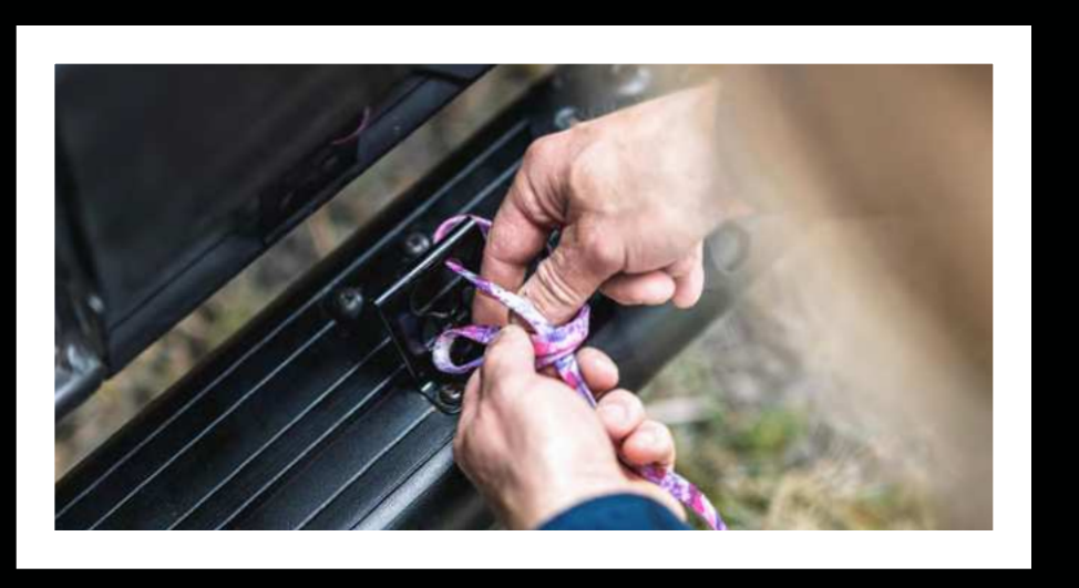
A cleverly designed pet tether lets you safely secure four-legged friends.