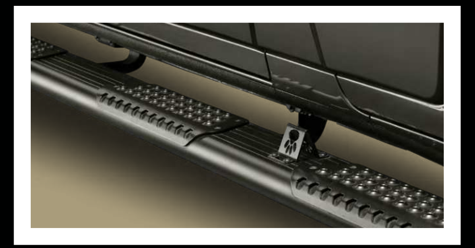
Powder-coated running boards with raised tread provide safe entry and exit.