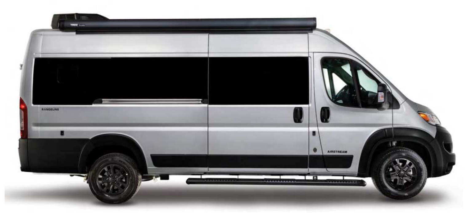
Bright Silver Metallic

Exquisite, prestigious, and gracefully distinguished