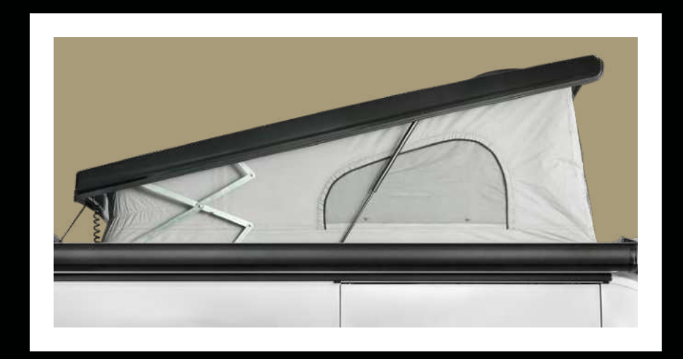
Optional pop-top has a large bed and opens up storage, living, and sleeping areas.