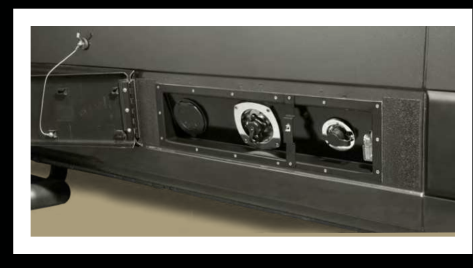
2 Water hookups are concealed behind a natural design.