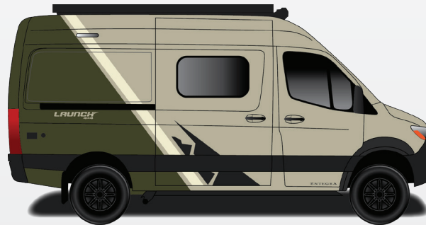
Forest Glade Partial Paint (Sandstone Van Only)