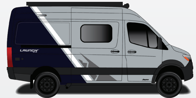
Mystic Tide Partial Paint (Blue-Grey Van Only)