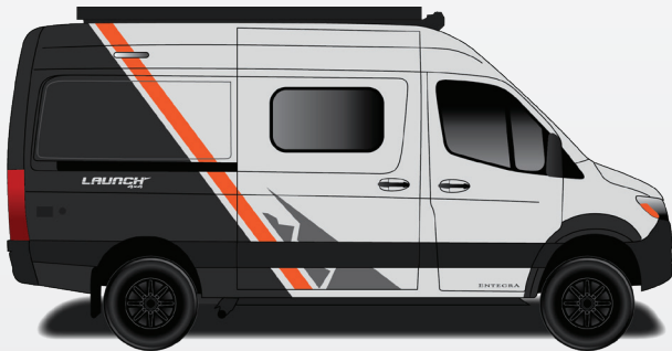
Aztec Partial Paint (Silver Van Only)