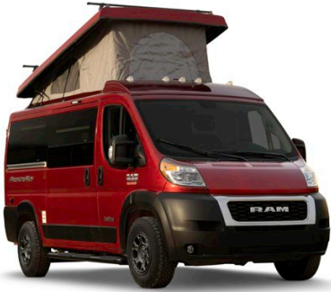
Deep Cherry Red Crystal Pearl