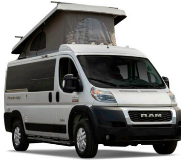
Bright Silver Metallic