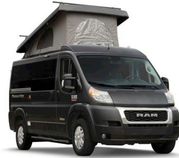
Granite Crystal Metallic