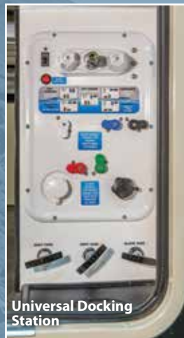
Universal Docking Station