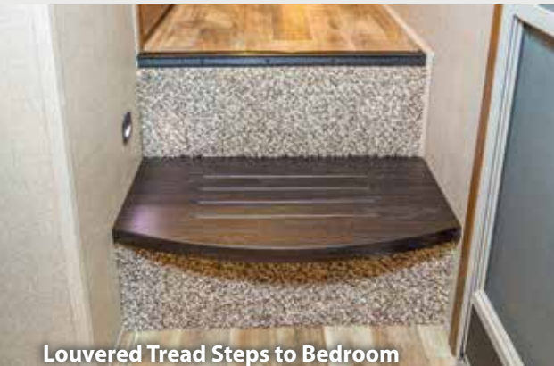
Louvered Tread Steps to Bedroom