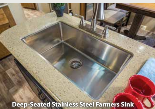
Deep-Seated Stainless Steel Farmers Sink