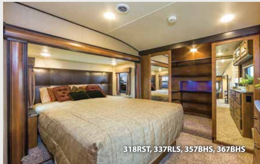
318RST, 337RLS, 357BHS, 367BHS