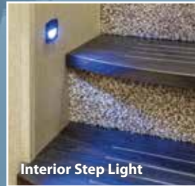
Interior Step Light