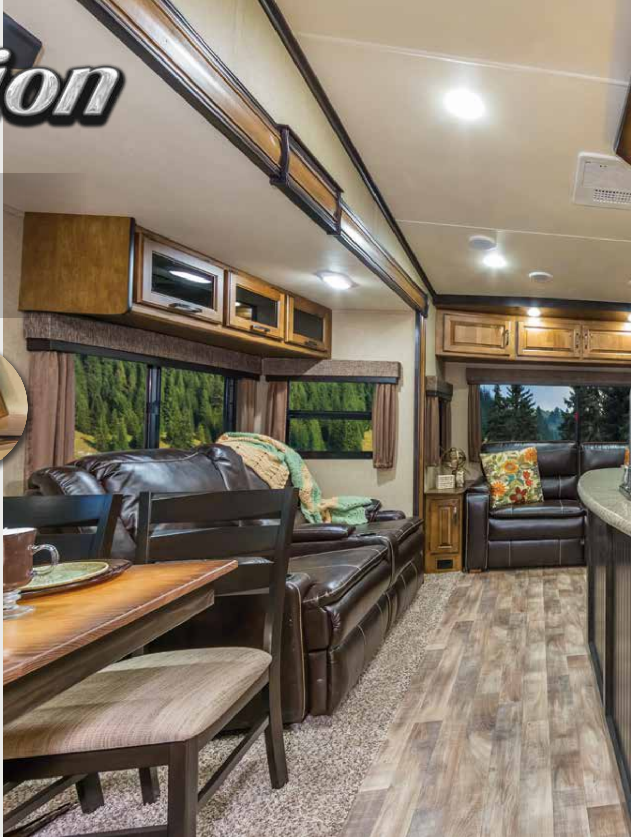
318RST, 337RLS, 357BHS, 367BHS