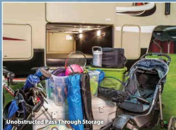
Unobstructed Pass Through Storage