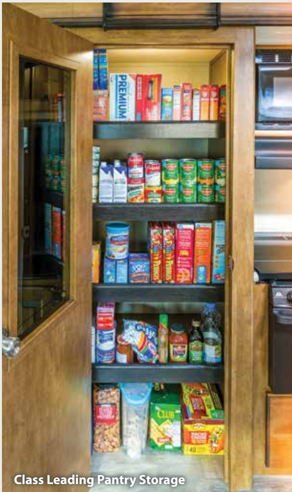
Class Leading Pantry Storage