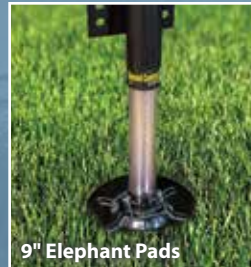
9" Elephant Pads