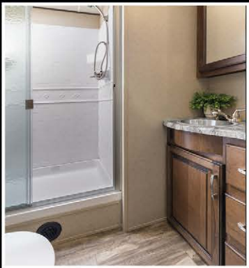
Spacious Master Bath (315RLTS Shown)