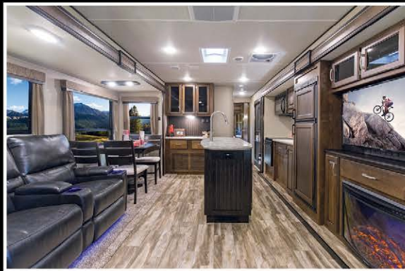
Spacious Living/Galley Area (297RSTS Shown)