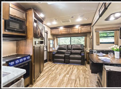
Spacious Living/Galley Area (230RL Shown)