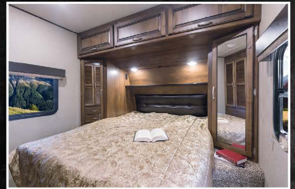
Residential Master Suite (297RSTS Shown)