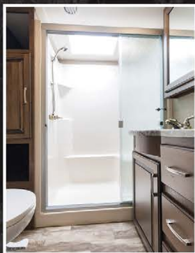
Spacious Master Bath (Bed slide models shown)

Nev-R Adjust brakes, bronze bushings and wet bolts, rubberized suspension equalizer