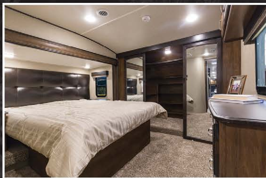
Residential Master Suite (Bed slide models shown)