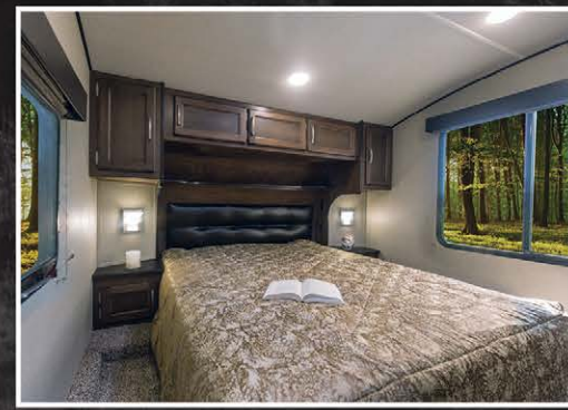
Residential Master Suite (230RL Shown)