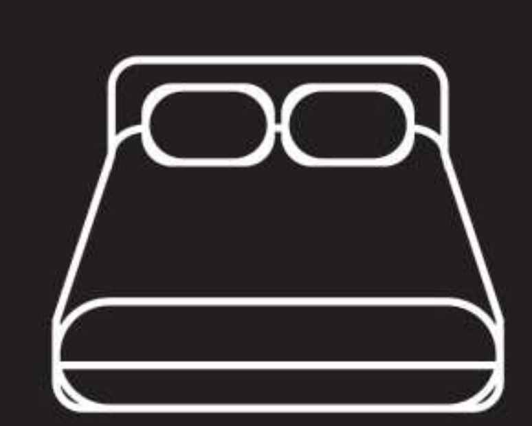
ULTIMATE COMFORT SLEEP LIKE ROYALTY IN OUR 70" X 80" KING SIZE BED