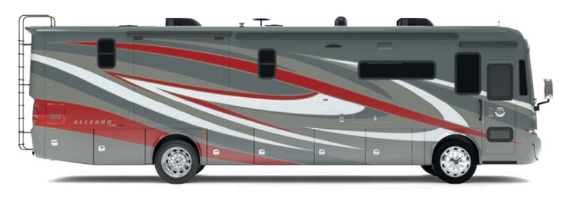
G1 SCARLET THUNDER