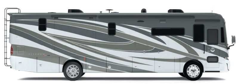
G1 SLATE GREY