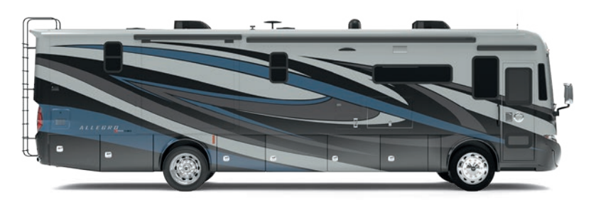
G1 BLUE DUSK

Our eight-step, full-body paint system features premium grade paints sealed with three layers of superclear coat with ultraviolet protection. An additional layer of high-performance film protects the front of the coach and select areas.