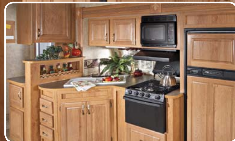
Manchester Oak cabinets offer a place for all your kitchen essentials — we even include a built-in knife rack. You'll also appreciate the 8 cu. ft. double-door refrigerator and oversized oven.