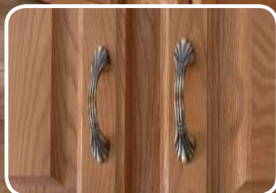
Raised panel cabinetry, accented by antique brass pulls, provides a warm and traditional look throughout the interior.