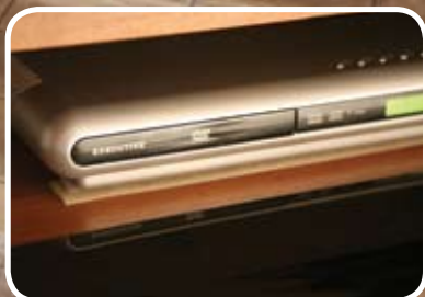
The Customer Value Package includes a home theater system with Dolby® Digital 5.1 Surround Sound and DVD/CD player.