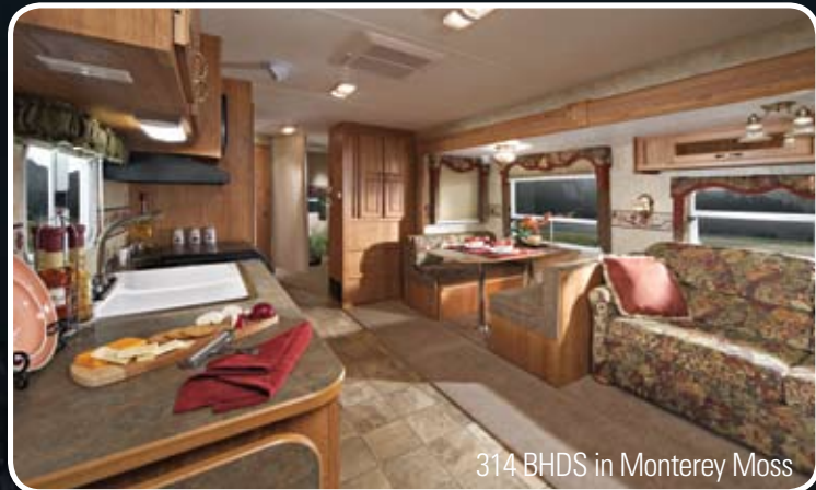
314 BHDS in Monterey Moss

The beautifully coordinated interior surrounds you in style, from the comfortable hide-a-bed sofa and dinette to the distinctive kitchen countertops.