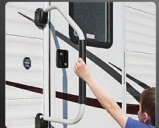
XL EXTENDED GRAB HANDLE