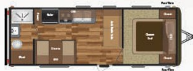
WEIGHT: 4700 LENGTH: 25' 11" 230LHS