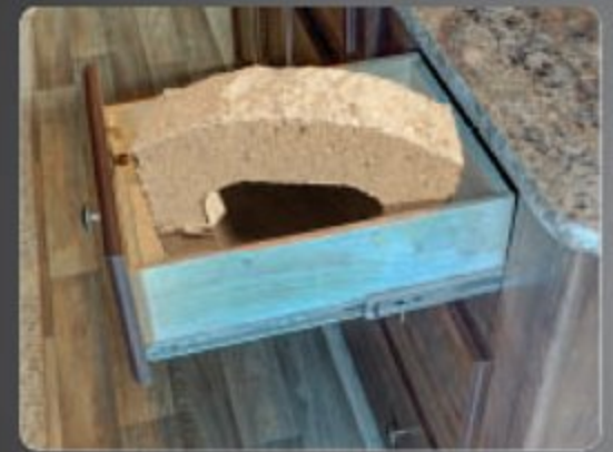
FULL EXTENSION BALL BEARING ROLLER GLIDES