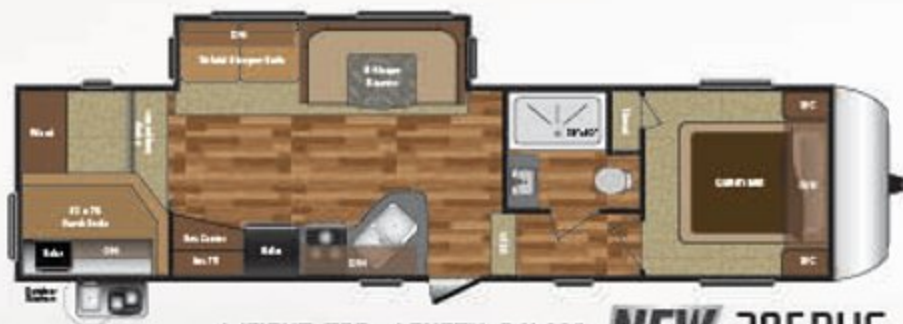
WEIGHT: TBD LENGTH: 34' 11" NEW 295BHS