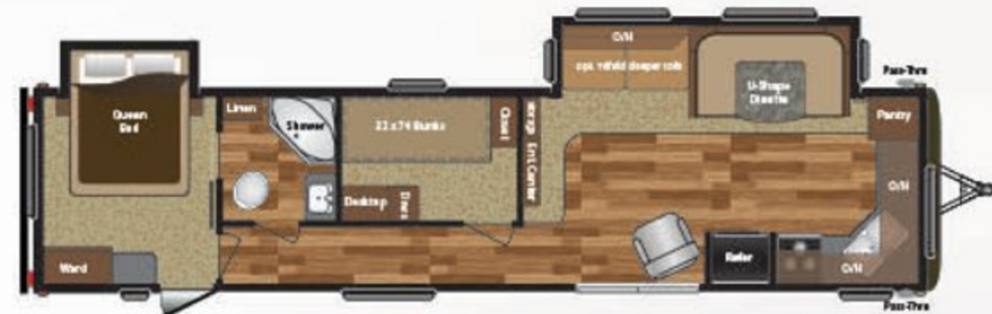
WEIGHT: 8542 LENGTH: 39' 11" 38FKDS