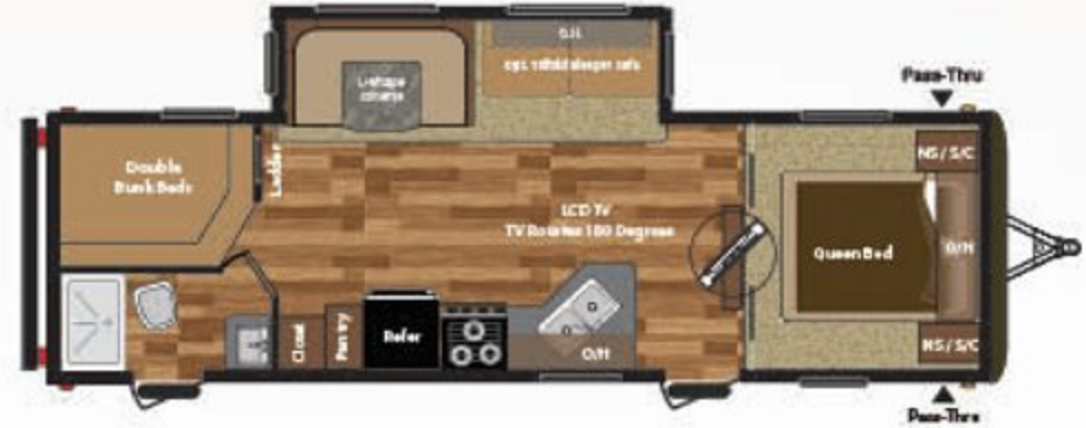
WEIGHT: 6760 LENGTH: 32' 3" 28BHS