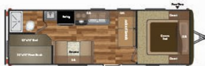
WEIGHT: 5020 LENGTH: 29' 3" 260LHS