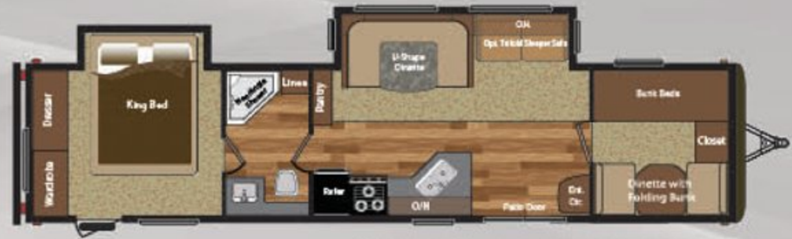
WEIGHT: 8348 LENGTH: 39' 11" 38BHDS

Hideout's bedrooms provide spacious sleeping quarters and loads of storage space for a great night's sleep.