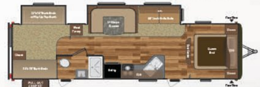
WEIGHT: 7681 LENGTH: 35' 8" 310LHS