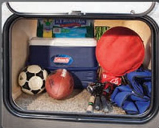
OVERSIZED BAGGAGE DOORS

Hideout is always just a touch away. You'll find 360 virtual tours, location of your nearest dealer, photos, videos and all of the latest information about Hideout on our easy to navigate website.