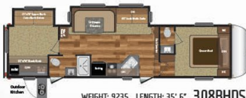
WEIGHT: 9235 LENGTH: 35' 6" 308BHDS