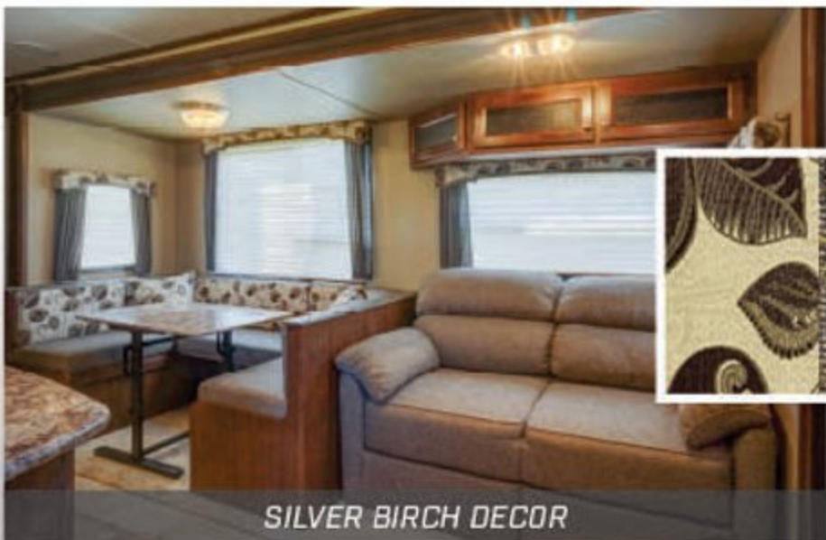
SILVER BIRCH DECOR