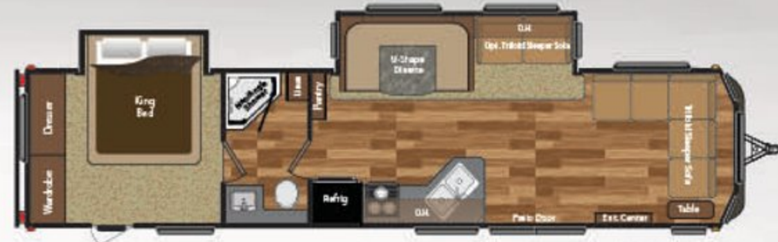
WEIGHT: 8284 LENGTH: 39' 11" 38FDDS