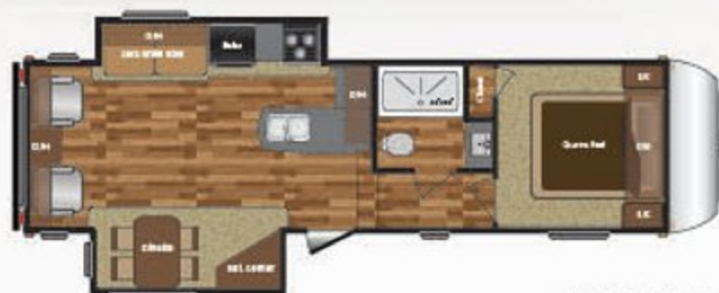
WEIGHT: 8040 LENGTH: 31' 1" 299RLDS