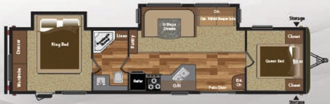
WEIGHT: 8363 LENGTH: 39' 11" 38FQDS