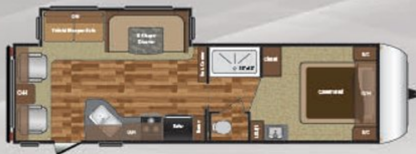
WEIGHT: TBD LENGTH: 30' 4" NEW 276RLS