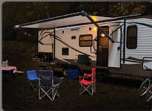
LED LIGHTED POWER AWNING