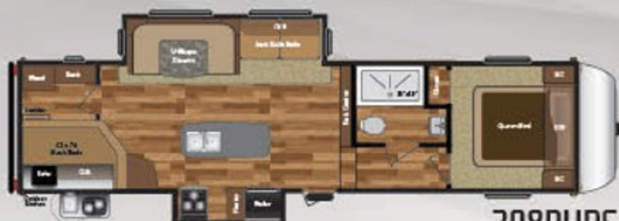
WEIGHT: 9045 LENGTH: 34' 11" 298BHDS