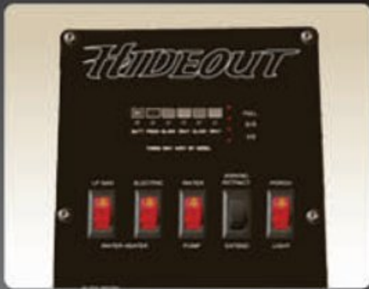
CENTRAL CONTROL PANEL