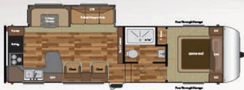
WEIGHT: 8070 LENGTH: 32' 1" 282RKS