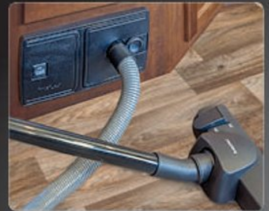
CENTRAL VACUUM SYSTEM

RELAX...THERE'S A HIDEOUT FLOORPLAN THAT WILL MEET ALL OF YOUR FAMILIES NEEDS. WITH A UNIQUE LINEUP OF FLOORPLANS THAT ARE LOADED WITH STANDARD FEATURES, HIDEOUT'S RESIDENTIAL STYLE INTERIOR IS YOUR HOME AWAY FROM HOME.