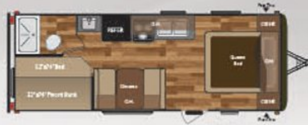
WEIGHT: 4590 LENGTH: 25' 4" 210LHS