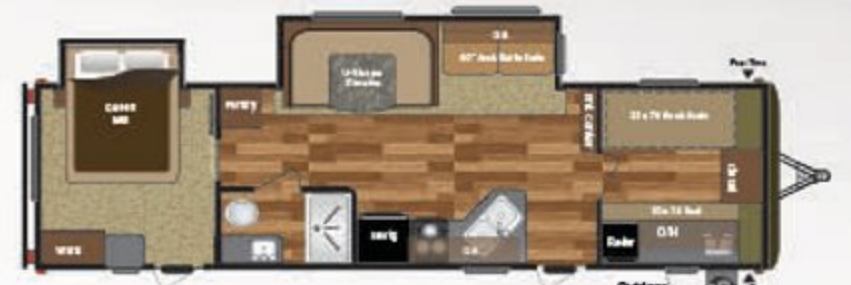
WEIGHT: 8055 LENGTH: 35' 0" 300LHS