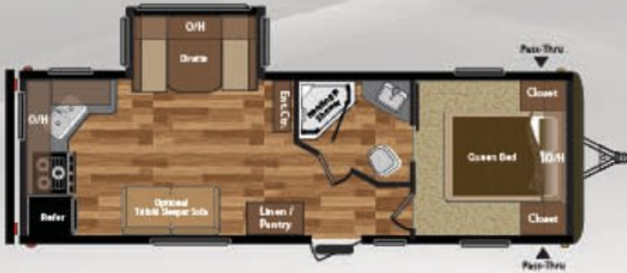
WEIGHT: 6039 LENGTH: 29' 8" 25RKS