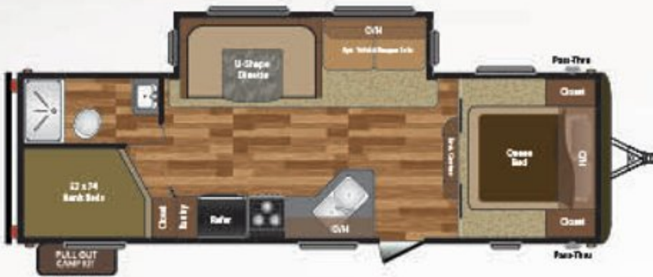
WEIGHT: 6517 LENGTH: 31' 6" 27DBS