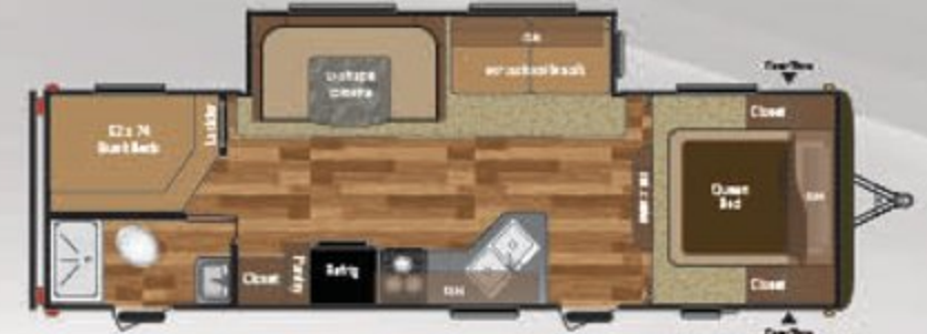
WEIGHT: 6600 LENGTH: 32' 3" 280LHS