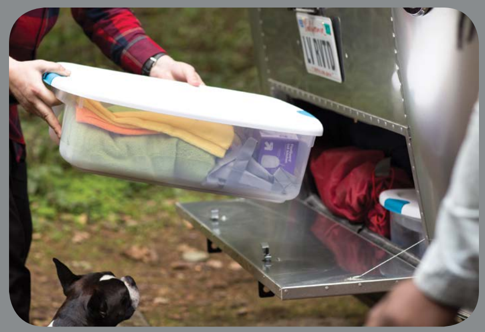
Stow gear and other bulk items in the convenient outdoor storage locker.