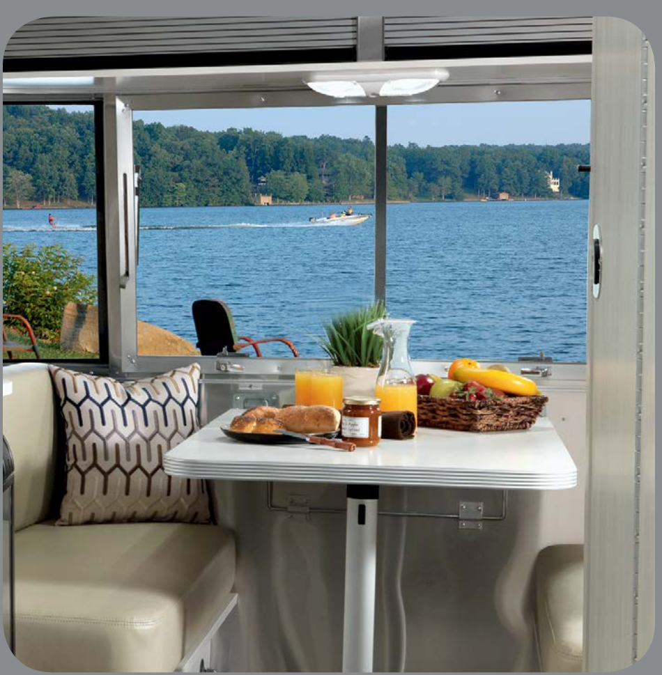
For great meals or game night, the dinette effortlessly converts to a lounging sofa or bed.

From the compact, intelligent essentials of the 16 ft. to the extra amenities and space of the 22 ft., the 2019 Airstream Sport is so well crafted and thought out that it delivers far more features than you'd expect in a trailer this size.