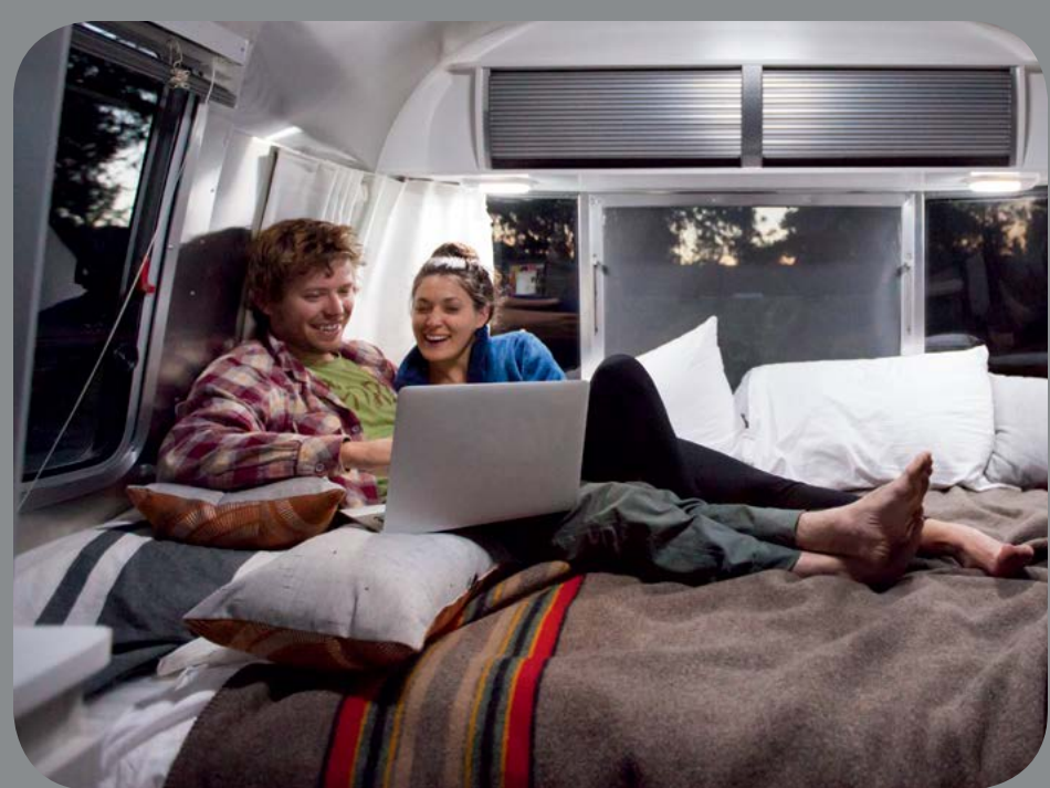
Sleep, watch a movie or relive the day's adventures in the spacious, cozy queen bed.