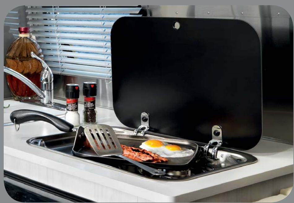
Two burners, infinite possibilities in the Sport's kitchen.