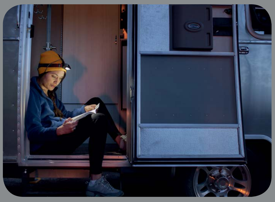
Read under the stars, by the light of the cabin, or a little bit of both.