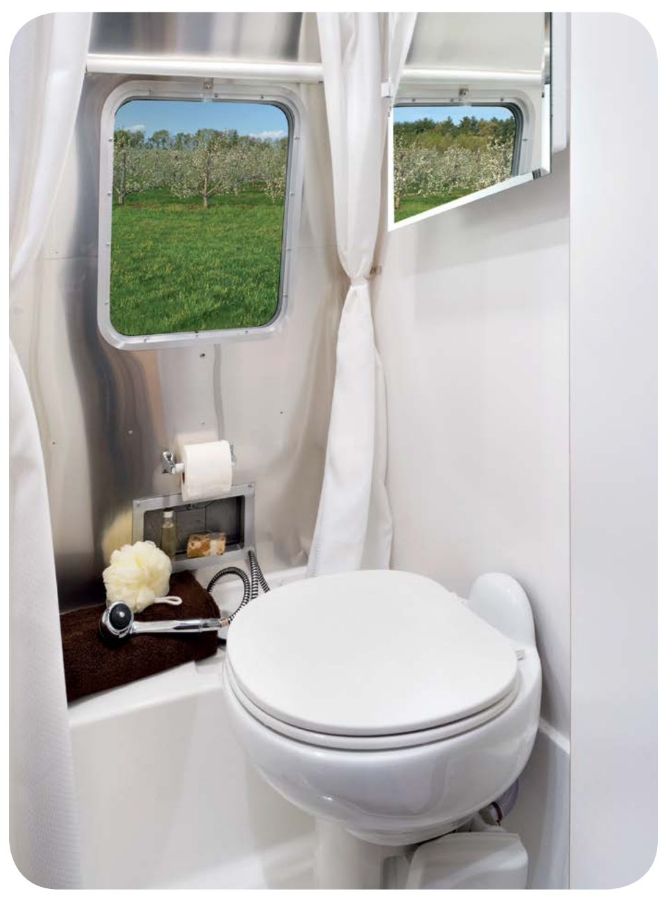
Bathe in natural light in the Sport 16RB lavy. Literally.