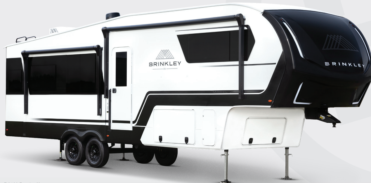
Z 3100 Exterior Shown