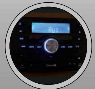
BLUETOOTH STEREO/DVD PLAYER (N/A 20RD, 21RB, 26BB, 26BK)