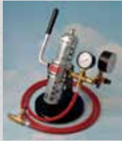
Seek-A-Leak Pressure Test

Prime Time Manufacturing is proud to be recognized as an industry leader in value, reliability, and overall quality by the Recreational Vehicle Dealers Association. We are committed to "A Higher Standard" in design, construction, testing, and customer service. Check us out — we know you'll be impressed!