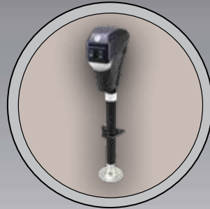
ELECTRIC TONGUE JACK (N/A ATI)