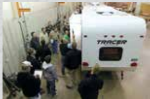
Executive Quality Audits